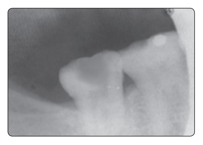
Fig. (1): A radiograph of a tooth suffering acute pulpitis.