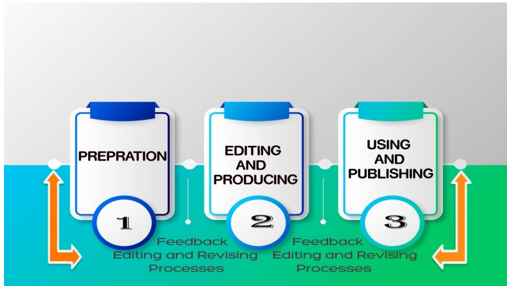
Figure (2) Amany Nabeeh El Mor's model of designing the Animated infographic

The model consists of three basic steps: preparation, Editing and producing then Using and Publishing. Each step is divided into sub-groups as follows: