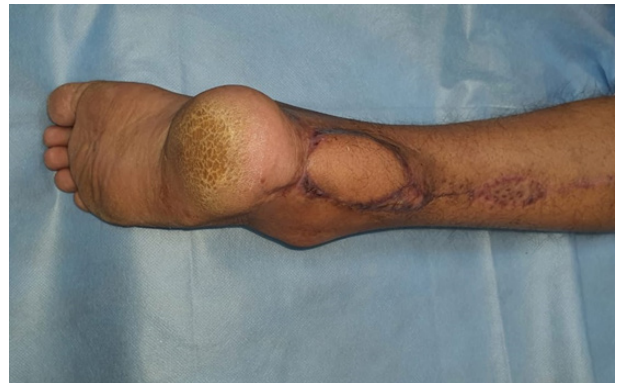
Fig 5c: Four months post operative.