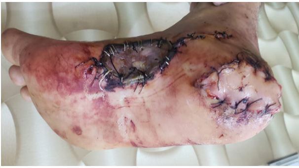
Fig 2b: Defect coverage by the flap and donor site closure with split thickness skin graft.