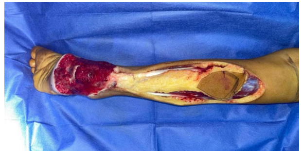
Fig 6a: Debridement was done flap raised.

Debridement and reconstruction by RSAF and split thickness graft was done.