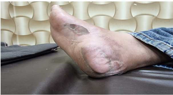
Fig 2c: Four months post operative.