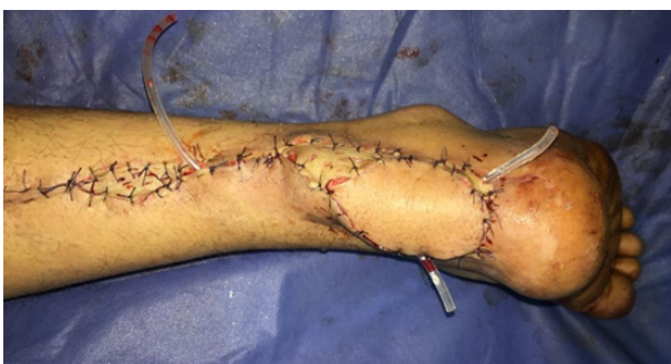
Fig 5b: Coverage of the defect with RSAF and donor site closure with split thickness skin graft.