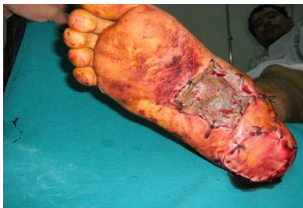
Fig 1b: Flap inseting to the defect and donor site closure by split-thickness skin graft.

Excision and reconstruction was done by MPAF.