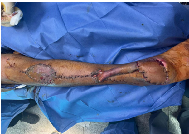
Fig 7b: Coverage of the defect with the flap and donor site closure with split thickness skin graft.