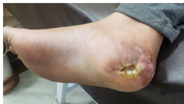
Fig 2a: Ulcerative lesion in the heel.