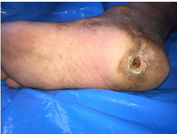
Fig 3a: Ulcerative lesion in the heel.

Excision and reconstruction was done by MPAF.