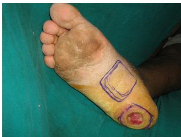
Fig 1a: Chronic ulcer in the right heel.