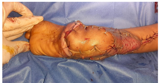
Fig 6a: Flap sitted to the defect.