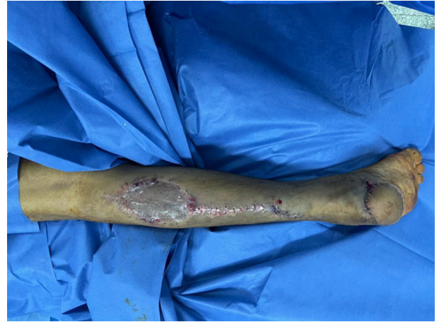
Fig 7c: After separation of the pedicle of the flap.