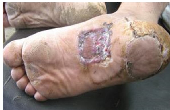
Fig 1c: 3 months post operative.

Forty years old male patient with chronic ulcer in the right heel excision & reconstruction done with medial plantar artery flap.