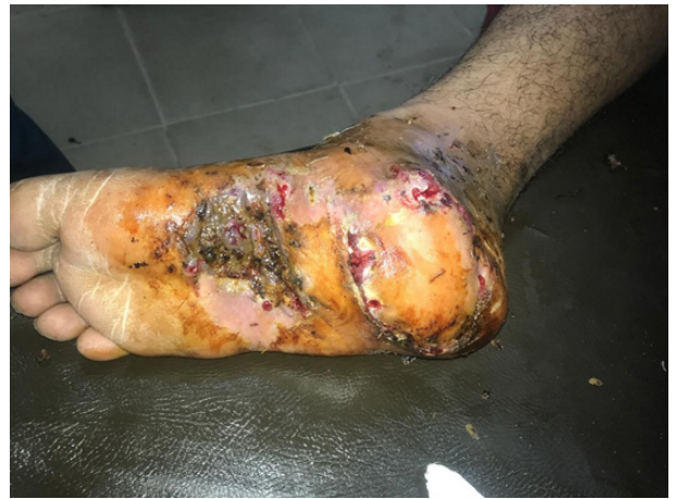
Fig 3b: Two months post operative.