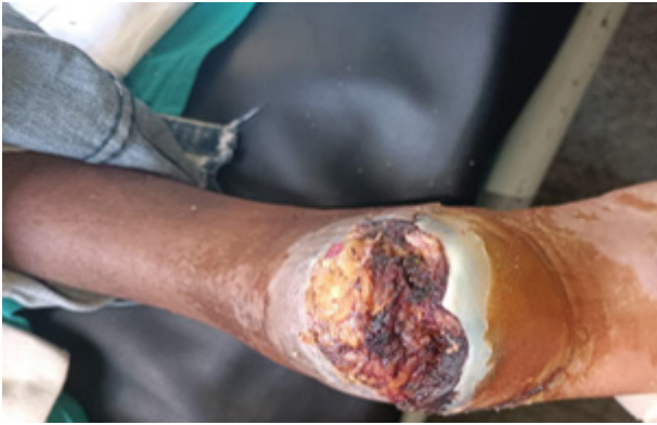
Fig 7a: Traumatic raw area in the heel.

Debridement and reconstruction was done with RSAF.