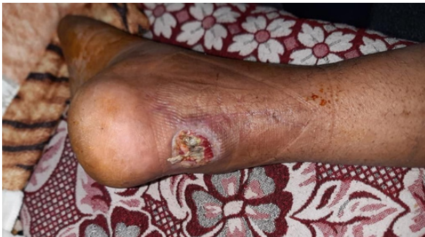
Fig 5a: Traumatic raw area over tendon achilles.

Forty years old male patient with traumatic raw area over tendon achilles ,debridement was done and reconstruction by RSAF.