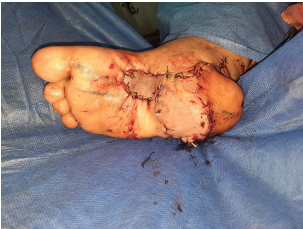
Fig 4c: Flap covered the defect and donor site closure with full thickness graft.