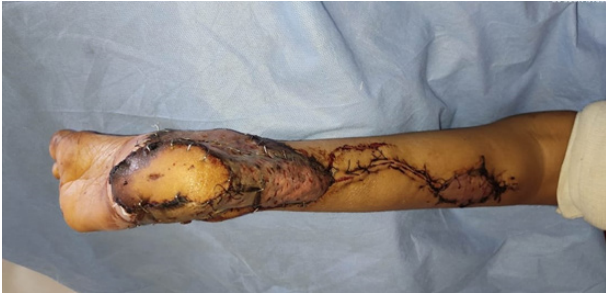
Fig 6b: Post operative follow up.