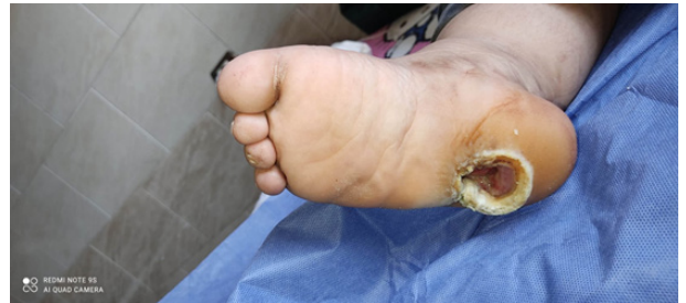
Fig 4a: Ulcerative lesion in the heel.

Excision and reconstruction was done with MPAF.