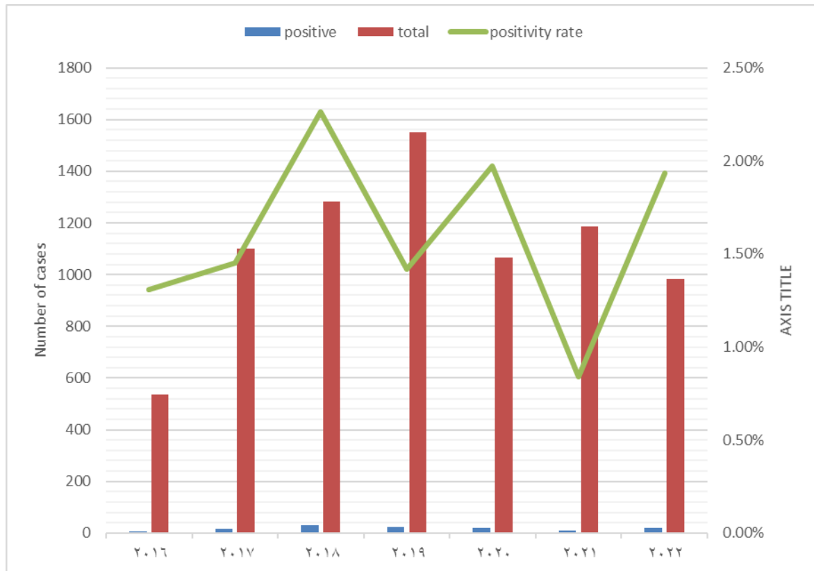
Figure (1): The TB-positive cases about the total number of cases from 2016 to 2022.