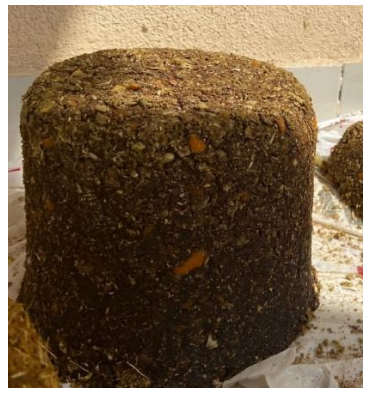
Figure 1. shows the shape of the Multi-Nutrient Concentrate Feed Blocks tested in this study

al., 2002). Table 1 presents the ingredient composition (DM basis) as well as the three distinct Multi-Nutrient concentrate feed block treatments. Combining concentrated ingredients with micronutrients resulted in the tested Multi-Nutrient concentrate feed blocks. To guarantee thorough and even distribution and reduce the danger of toxicity, they were carefully mixed by hand with the binder, which included both quicklime and cane molasses. Each binder was added individually by spraying it after diluting it with water, as Ben Salem et al. (2000b) recommendations. Since the hydrophilic nature of the pectin in the waste may be destroyed by adding lime (Ben Salem et al., 2000b). The mixture was firmly compressed well into metal molds that were cylindrical in shape, yielding approximately 2 kg of blocks measuring 20 \times 15 cm. The Multi-Nutrient concentrate feed blocks were placed in a well-ventilated, shaded area. They need to be rotated periodically to accelerate the drying process until they are completely dry. Until the animals are given them, the experimental Multi-Nutrient concentrate feed blocks are kept in storage.