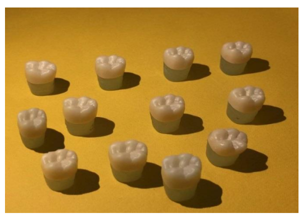
Figure (2): The milled crown restorations.