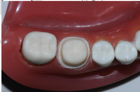
Figure (1): The prepared die.

The evaluation of the internal and marginal adaptation was performed by measuring the cement film thickness after sectioning the restorations in mesiodistal and buccolingual directions. To avoid cracking, the coronal portion of each specimen was embedded in a transparent self-polymerizing acrylic resin. Precise cutting of the crowns into four quarters was done by using a precision cutting machine (Buehler Isomet 4000 Linear Precision Saw) under water-cooling. Polished sections were examined under stereo-microscope (SZ1145TR, Olympus, Japan) and image analysis software was used to measure fit accuracy in each section in each site of the restoration (Nine different point-locations present along crown die interface) (Fig. 3).