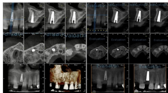
Figure (3): CBCT immediate after implant placement & 6 months postoperative.