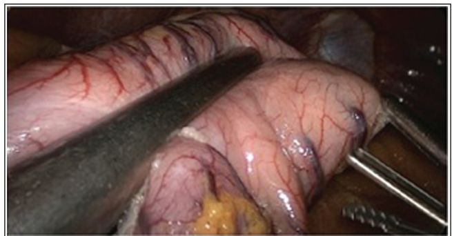
Mechanical stapler positioned for early gastric body tubing with a gastric tube 36 Fr modeling the stomach.