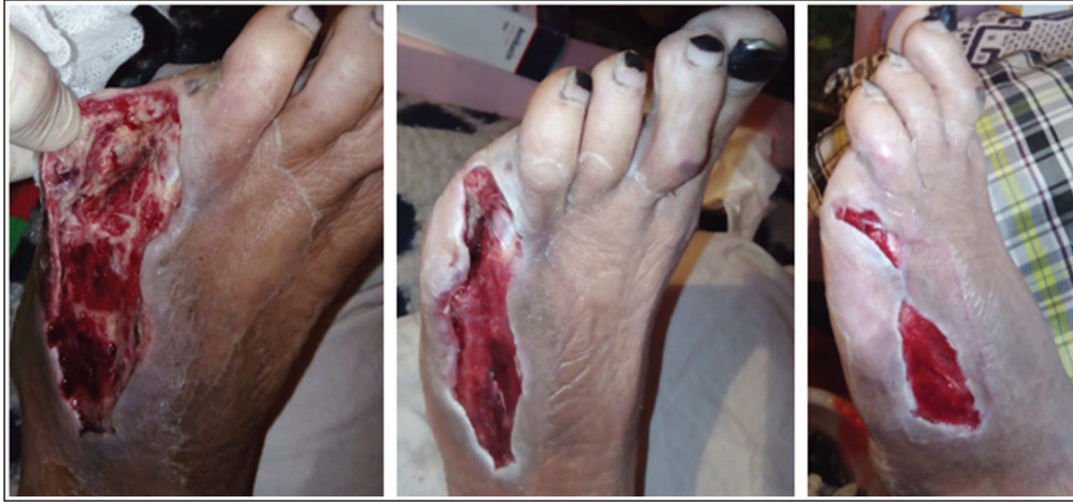
Post fifth toe amputation and dorsum of the foot debridement (4 weeks on vacuum-assisted closure).