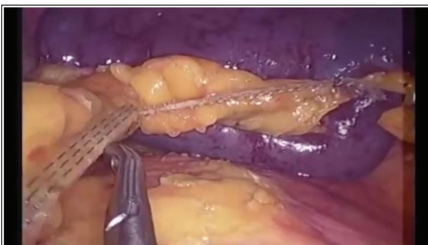
Pedicle stapled by three rows of staples.