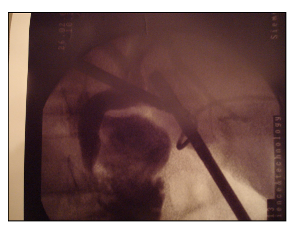
Fig 2. A clear biliary tract.

Operative cholangiography was attempted in all patients (even those who had preoperative ERCP) (Fig. 2). The operative time for the cholangiography procedure ranged from 15-40 minutes with a median duration of 25 minutes. It was successfully completed in all except 3 (10%) patients, in whom the initial cut in the cystic duct was large resulting in its complete division, while manipulating the catheter into the duct. In these cases the anatomy was clear and thus cancelled. cholangiography was Four (13%) cholangiograms revealed short wide cystic ducts. Three (10%) cholangiograms revealed stones in the CBD (Fig. 3). One of them was totally unsuspected preoperatively. The remaining two patients had mild elevations of liver enzymes preoperatively, without clinical symptoms or signs. All had one or two small stones and these three patients were refered for postoperative ERCP.