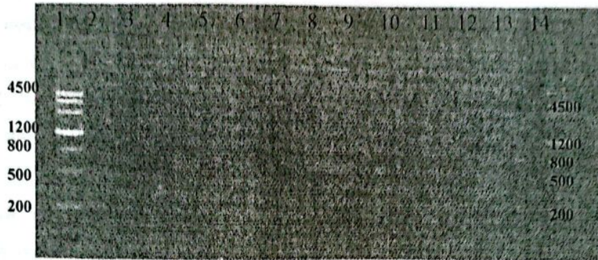
Photo (1): Results of PCR amplification of pigeon poxvirus and agarose gel electrophoresis; lanes 1 and 14 are the DNA ladder, lanes 2-11 represent field samples where the positive result indicated at 578 bp, lanes (4, 8, 9, 10 and 11). Lane 12 is the positive control and lane 13 is the negative control.

Real time PCR dissociation curve of PCR products of the qualitative SYBR Green PCR assay indicated that the PCR products of