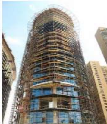
Fig. 6: Hotel towers in Cairo Maadi under construction