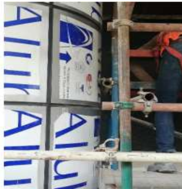
Fig. 12: scratches on building skin column cladding units