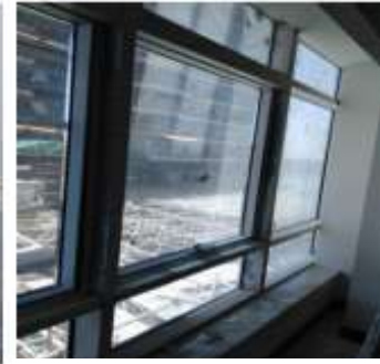
Fig.10: cutting and scratch in the glass protector

5- Broken at the ceiling for the electric wires of seminic company at the building skin side while installation. This problem led to wastes in (time and material) during installing building skin. Fig. 14, 15.