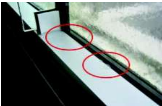
Fig. 4 (A): (Installation issues)Water ingress observed during laboratory static water penetration resistance testing.

For this reason, the cladding sequence should be shown on the appropriate contract drawings and any changes should be discussed with the structural engineer, so that the structural implications may be assessed. The cladding installation sequence may also be important in terms of forming the laps between the sheets and obtaining airtight joints at interfaces. Where the cladding manufacturers provide specific recommendations for the installation of their products, these should be followed carefully.