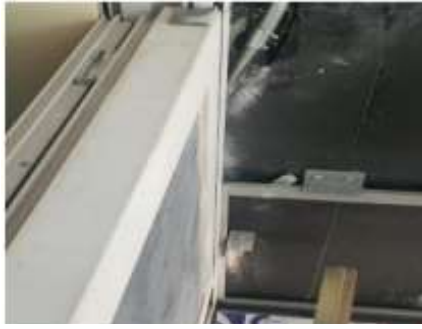
Fig.8: Installing Jebesen board on the aluminum units of the skinned on its units