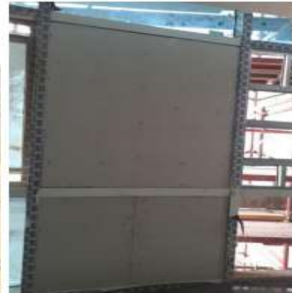
Fig.7: Installing Jensen board on the aluminum units of the skin not on its units Source:

3-Cutting and scratch on the glass protector cause of the lack commitment of the Schedule time for construction project. This late was from the owner so it has to hiring another company to repaired the defects which lead to waste in (time, money) Fig. 10.