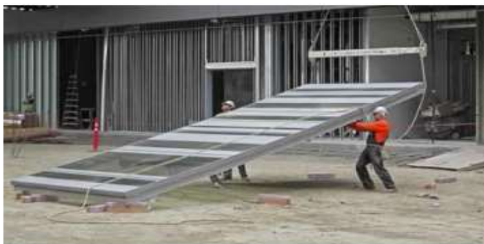
Fig. 2 (A): (UP) Curtain wall installation complete at Hyundai Motors