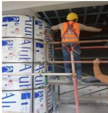
Fig. 11: scratches on building skin column cladding units

6-Extra part in concrete must be removed so that skin engineer gives markers to the contractor to adjust the building skin level and equal the rest of the skin as required which led waste in time. Fig. 16.