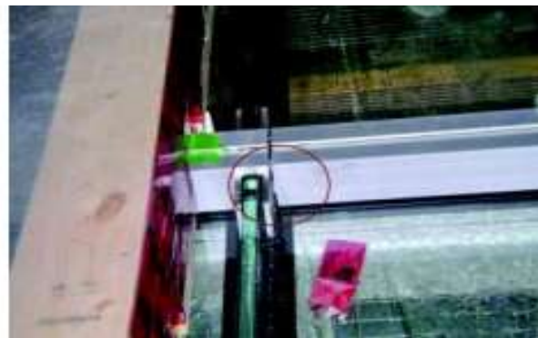
Fig. 4 (B): (Installation issues)Unexpected water ingress at a butt joint in the horizontal mullion during the test chamber