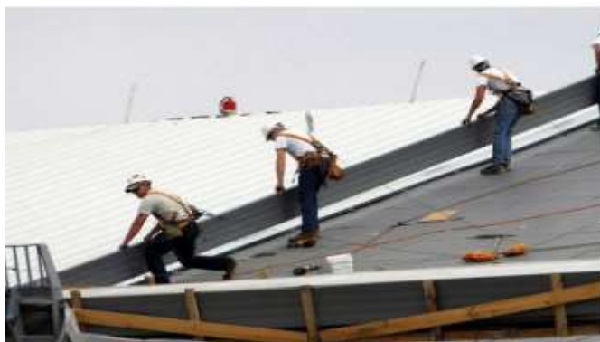
Fig. 3 (A): Safe construction at building envelope.