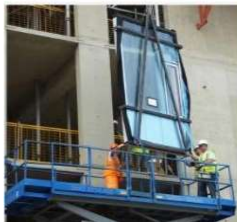
Fig. 3 (B) : Safe construction at building envelope.