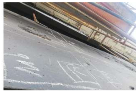
Fig.16: m Extra part in concrete must be removed

From the previous observations the researcher proposed a framework to avoid the defects and problems during building skin installation by knowing its processes and activities and consider them whether main or sub processes