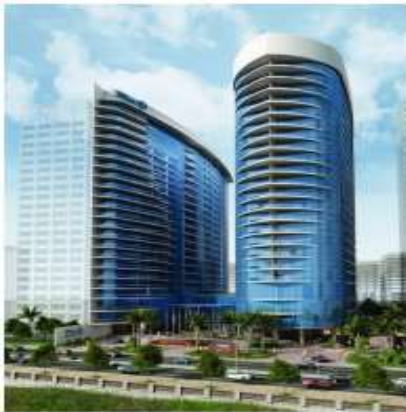
Fig. 5: Hotel towers in Cairo Maadi

2-There were water spots on building skin cladding cause of the consultant did not match the drawing with the reality and didn't take with the notes of the designer to make the owner satisfaction with neglecting this result. Fig. 9