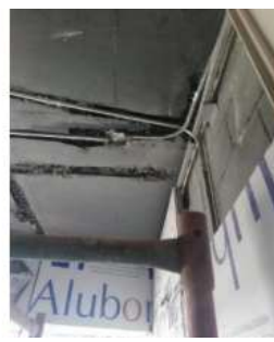
Fig. 15: broken at the ceiling at the skin side