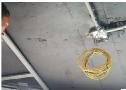
Fig. 14: broken at the ceiling at the skin side