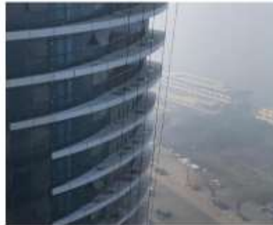
Fig.9: Water spots on building's cladding