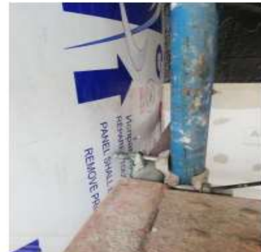
Fig.13: scratches on building skin column cladding units