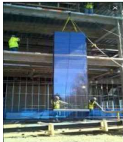
Fig. 2 (B): (left) Curtain wall installation at the Yale school 2012