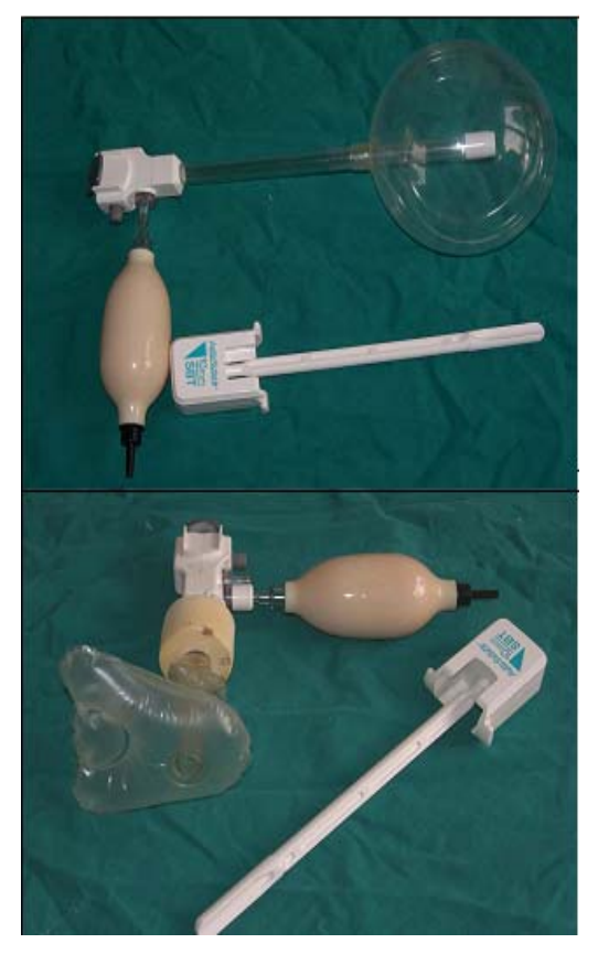
Fig 1. The dissecting balloon (top) and the horseshoe balloon bottom.