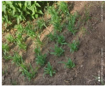
Fig. 2. Block of land was constantly planted with maize for rearing the pest during the summer season of 2021