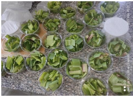
Fig. 4. Cups where, from the Third instar larvae were reared until pupae.