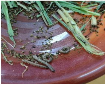
Fig. 1. FAW larvae were reared on maize

given new leaves of maize. Food was changed every two days in small plastic pots of 7cm in height and 5cm in diameter (Fig. 4), larvae were raised independently from the third instar and covered with fine muslin (Dahi et al. , 2020).