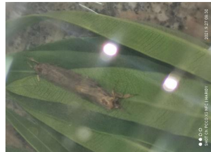
Fig. 5. Mating in males and females of the pest.