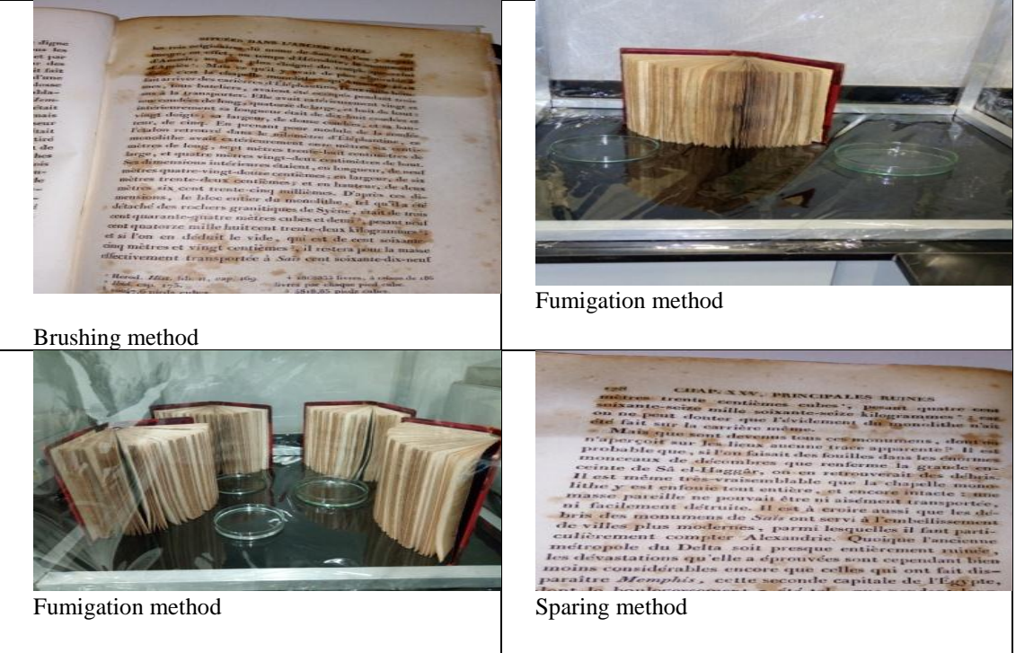
Fig (3): Different methods applying to the microbial treatment.

sealed tight as shown in Fig. 3 . After Application, we found the suitable method to apply is fumigation within the place of tightly sealed. This is in fact a new method for eradicating paper destroying organisms. These so-called "fumigation" methods require the use of sealed chambers and are sometimes a good alternative to microcides.