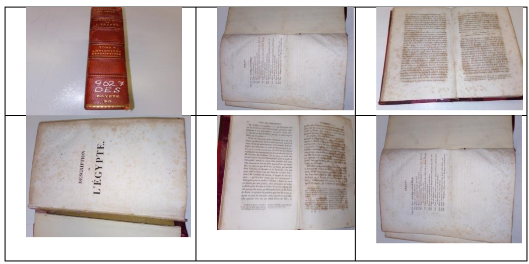
Fig (1): The biodeterioration of the manuscripts.

Swabs were obtained from rare books from the parliament of the Arab Republic of Egypt. Most of books suffer from severe microbial infections, which are manifest in the presence of clear microbial lesions in the form of brown spots, which have been combined in many pages of books to cover the entire pages in brown color (Fig. 1). Microbial swabs were cultured on plates of cellulose, protein and nutrient agar media.