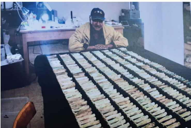
Ushabti statues being counted and cleaned in the mission's storage.