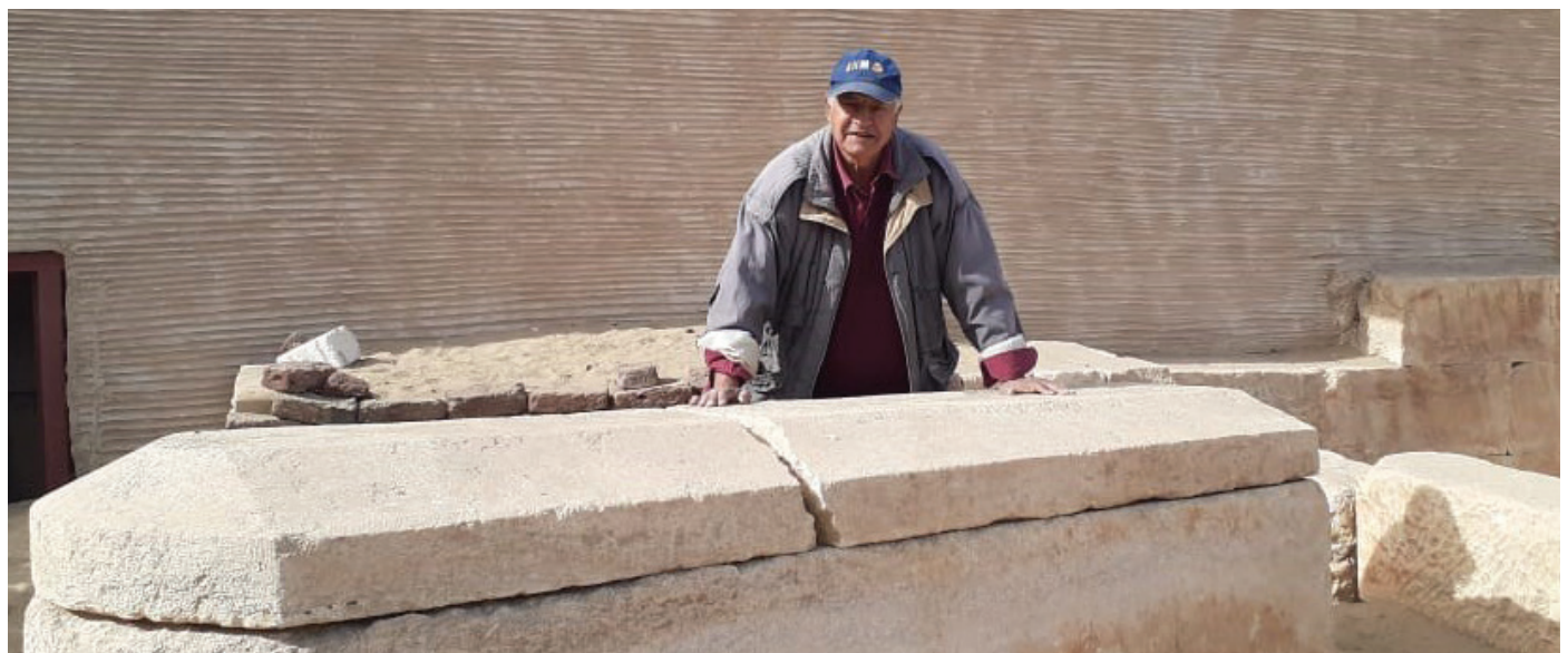
In front of tomb number 14 from the Saite period.