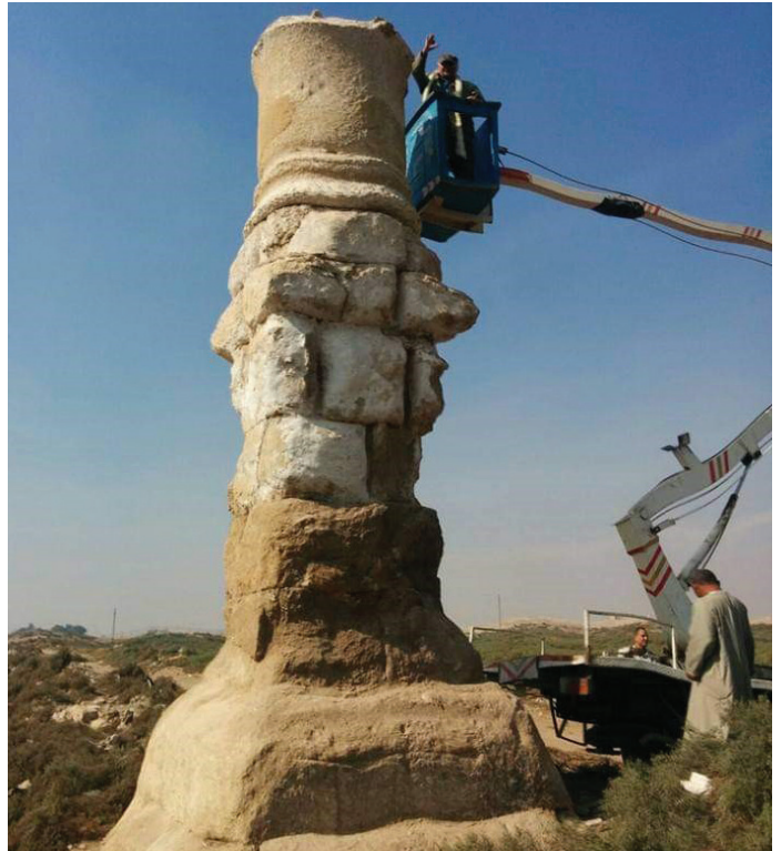
During work at the Beni Hasan site.