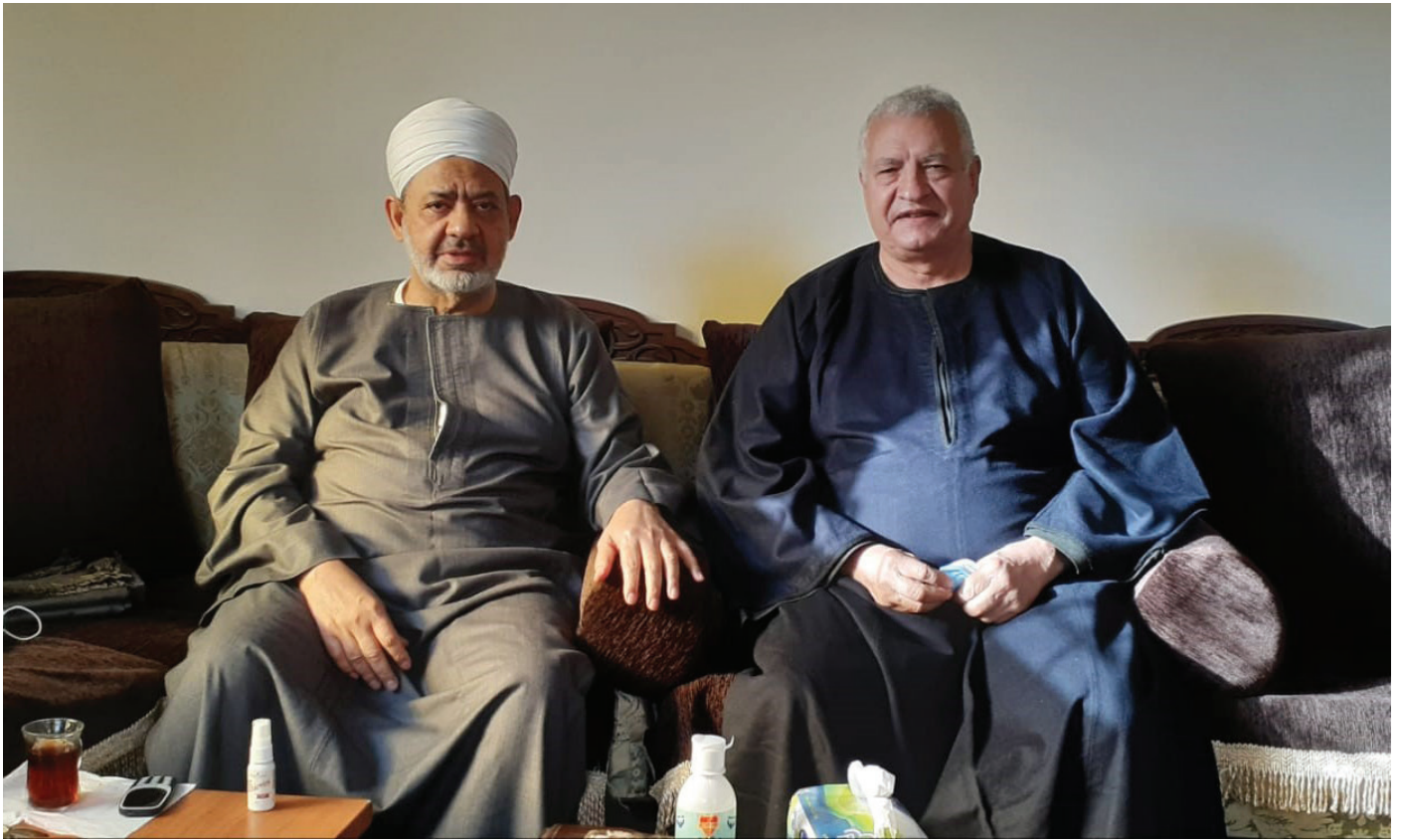
Together with Grand Imam Ahmed Al-Tayeb, Sheikh of Al-Azhar, at his home in Luxor.