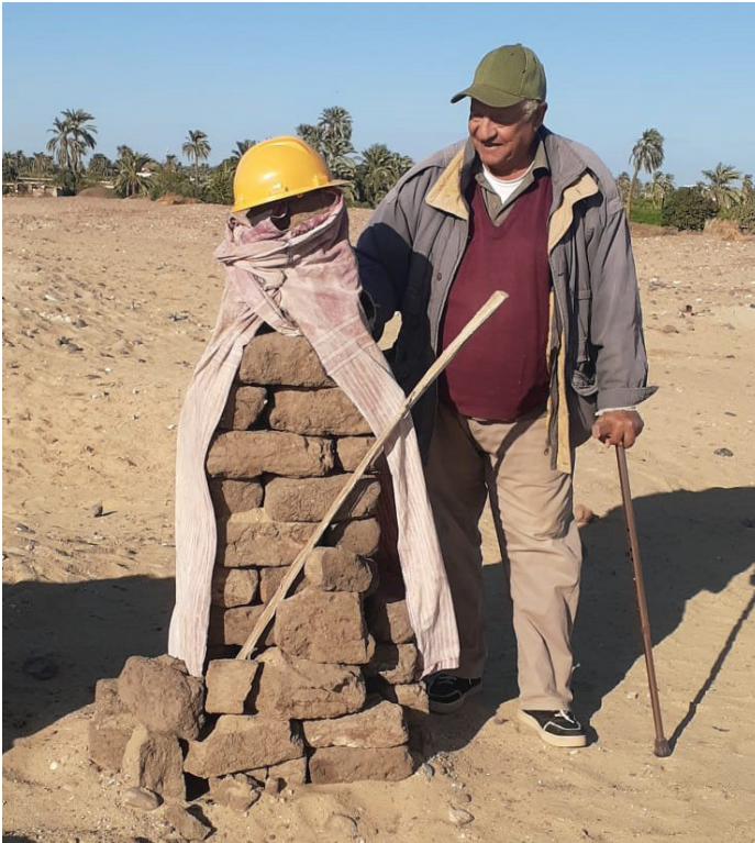
Accompanied by the scarecrow ... a diligent guardian..