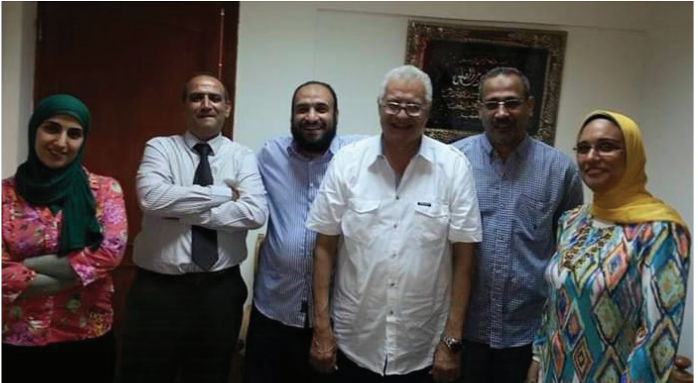
During the first meeting of the Greco-Roman Archaeology Department after its establishment at the Faculty of Archaeology, Cairo University.