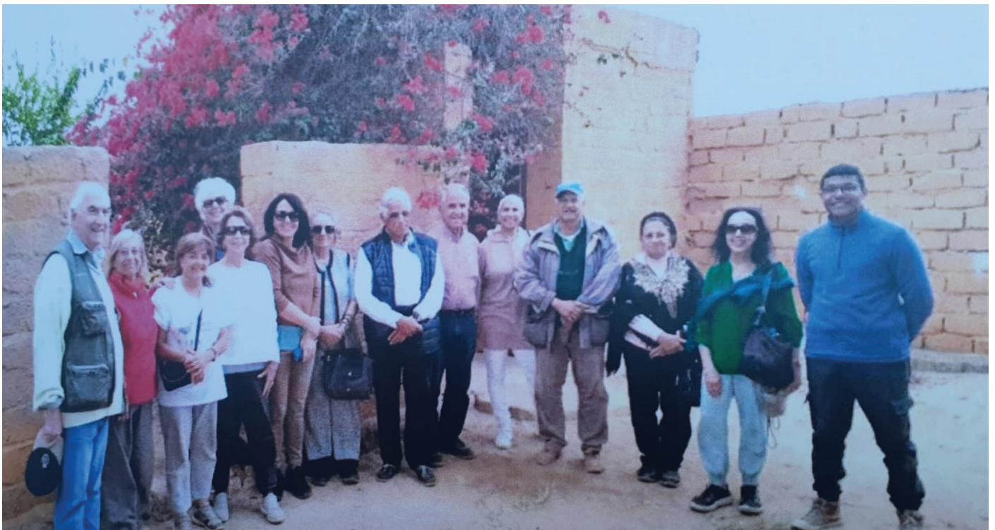
Prince Abbas Hilmi's visit to Beni Hasan accompanied by friends of the Manial Museum.