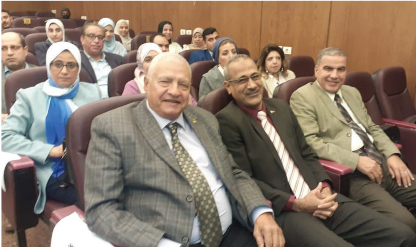
During a seminar at the Faculty of Archaeology, Cairo University.