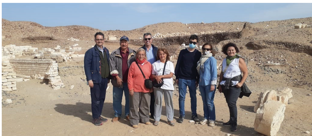
With the Spanish cultural counselor (far left) and embassy members during their visit to the Beni Hasan site.