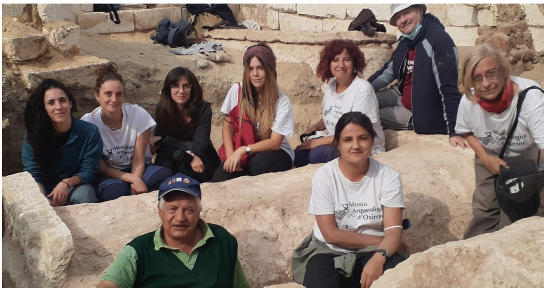
With mission members in front of tomb 54 during the 2022 season.