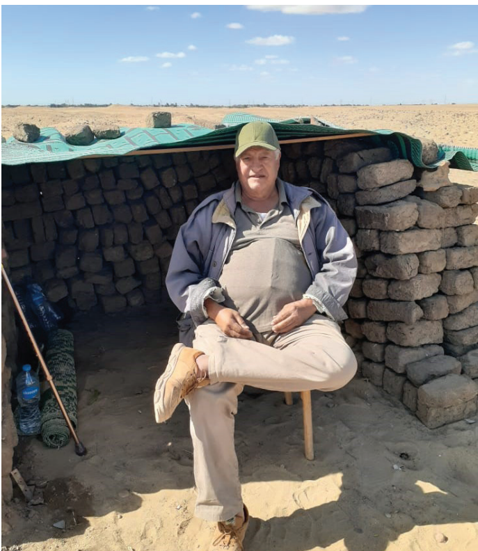
A short break during excavation work