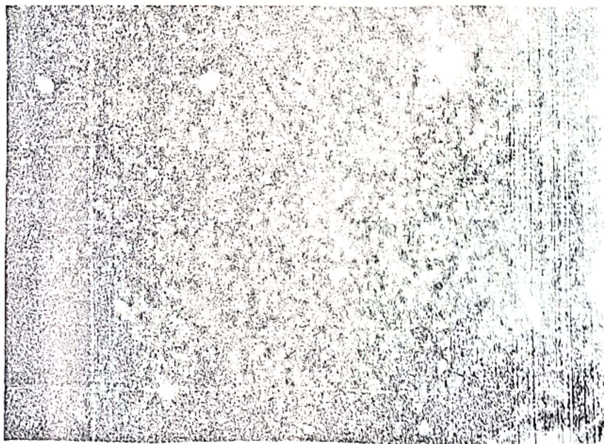
Fig. (4) Showing negative fluorescence in Vero cells