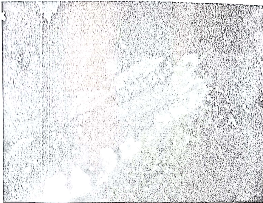
Fig. (1) showing intracytoplasmic fluorescence in leukocyte cells of buffy coat.