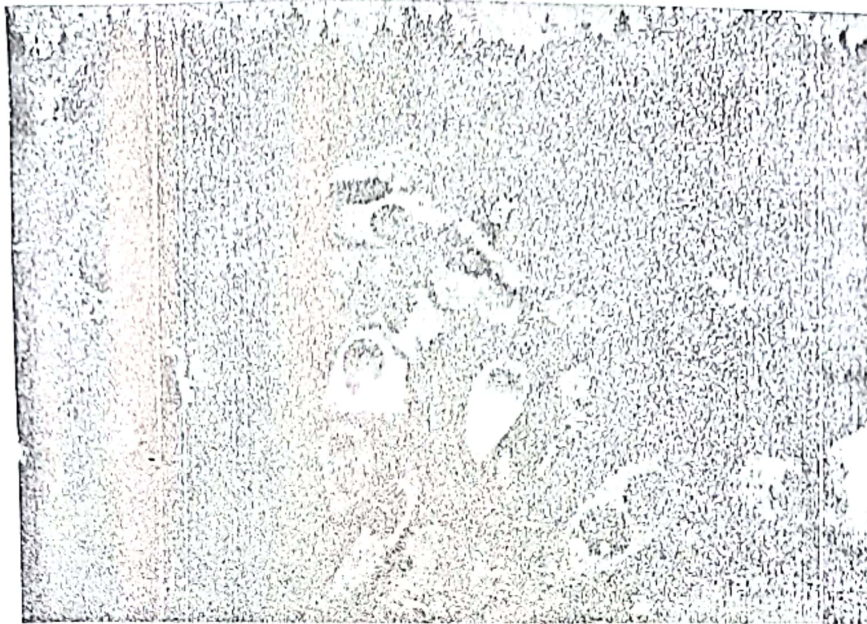
Fig. (3) Showing intracytoplasmic fluorescence in Vero cells