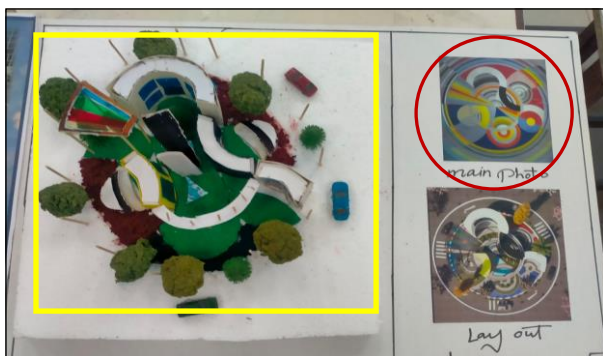
fig. 2. A proposal for a cultural complex project taken from an abstract painting of geometric shapes.