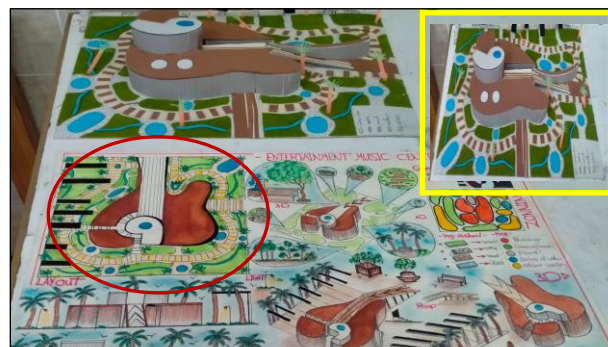
fig. 6. The Music Education Center project proposal is taken from an abstract painting of geometric shapes.