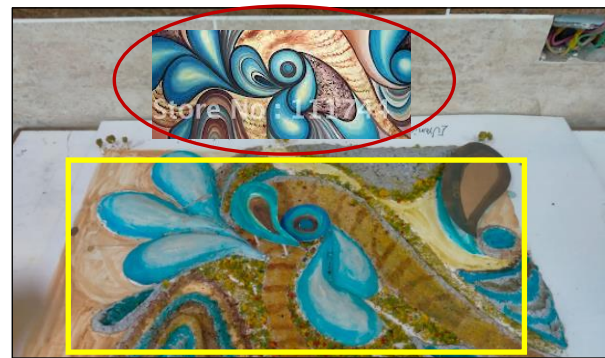
fig. 5. The Aquarium Museum project proposal is taken from an abstract painting of geometric shapes.