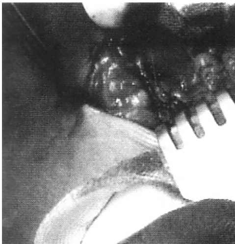
Fig. (1) : Blue-stained lymph Tract is followed down into the Axilla.