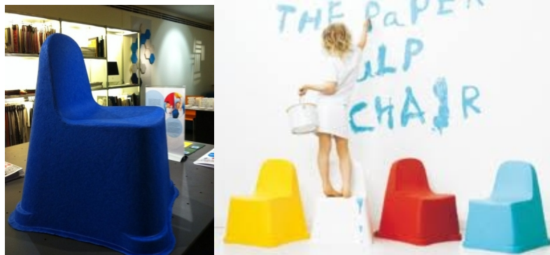
Picture 1 - A simple chair made of pulp paper inspired by the design of egg packaging paper.

The regular process of paper recycling involves mixing used paper with water to break it down. It is then chopped up and heated, which breaks it down further into strands of cellulose, a type of organic plant material; this resulting mixture is called pulp, or slurry. It is strained through screens, which remove any glue or plastic that may still be in the mixture then cleaned, de-inked, bleached by Dioxin and chlorine gas, then dried to produce white paper sheet. Here is where the environmental problem, because of the waste water of such process, the water supplies polluted.