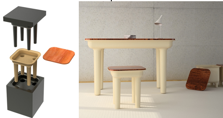
Picture 2 - By using a molding technique has become a new form of furniture design

The main body of Pulp Furniture is produced by pressing the recycled pulp. Then, the skin is covered by any materials so that it renders the impression that the furniture is made of the wood from the scratch. The thick pulp has the right intensity for carpenters to work on, and with special treatment it can be protected from water. Pulp Furniture can also be reborn by changing the main body and get a new function.