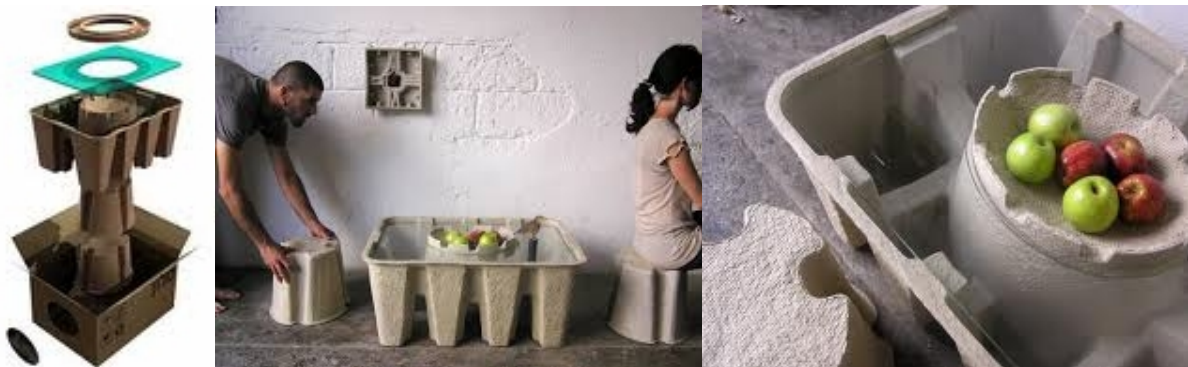
Picture 3 - Modern Paper Pulp Furniture Looks like Giant Egg Cartons. It Explains the features that Lightweight, transportable, biodegradable, recyclable and just plain awesome