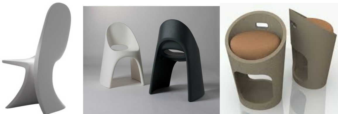
Picture 6 - A variety of designs for seats molded in different shapes and colors reflect the spirit of contemporary and suitable for all internal spaces. The decisive and rigorous lines of the chairs contrast with the dynamism of its profile, a sense of movement which is accentuated by the union of curved and straight lines