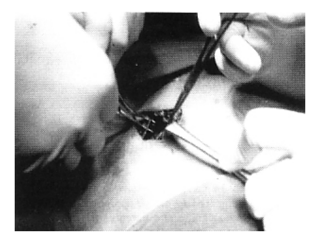
Fig. (2) :Laparascopic trnsperitoneal varicocolectomy