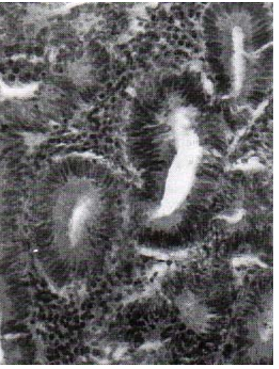
Fig (2): (.1) Mucosa from resection margin far from the tumor showing microadenoms with pseudostratification of the gland lining, loss of mucus goblet cells and complete luminal obliteration (H&E X400).

(.2) Mucosa from resection margin far from the tumor showing microadenoms with pseudostratification of the gland lining, loss of mucus goblet cells, slit like glandular lumina and complete luminal obliteration (H&E X400).