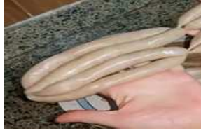
Fig.3. processed sausages