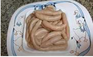
Fig.4. manufactured Sausages