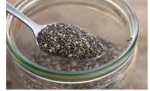
Fig.1. Chia seeds