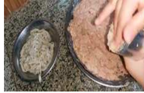
Fig.2. Sausage filling