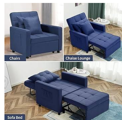
Pic. (8): Convertible Chair sample.

https://www.cgtrader.com/3d-models/interior/bedroom/modern-bed-with-storage-multifunctional-bed