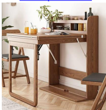
Pic.(6): Foldable Desks and Tables

https://www.designboom.com/design/james-howlett-restyle/