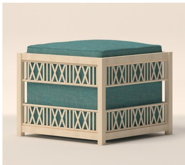
Pic. (23): Multifunctional stool used in both seating and storage. (designed by the Author)