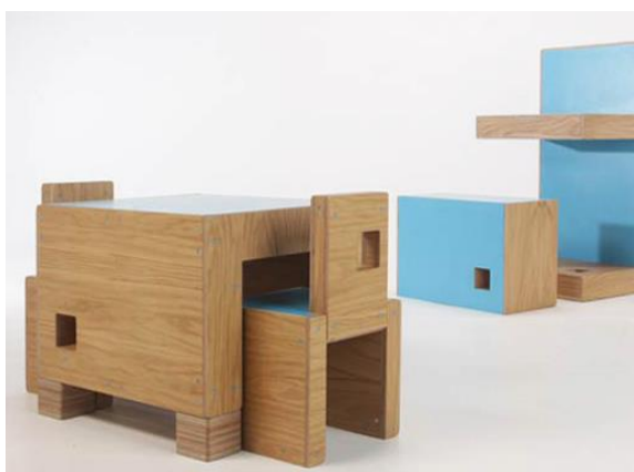
Pic. (5): Modular Furniture that provides multifunctional furniture e pieces.

https://www.amazon.com/UFINEGO-Folding-Extendable-118-50inch-Console/dp/B0C33ZSLXV