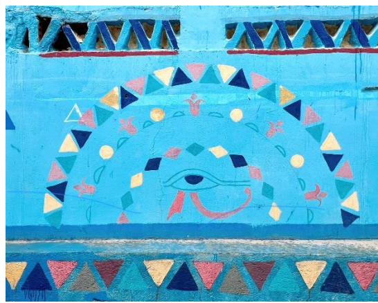
Pic. (12): Wall painting on a Nubian house.

https://www.ask-aladdin.com/all-destinations/egypt/category/egypt-site-guide/page/nubian-sites