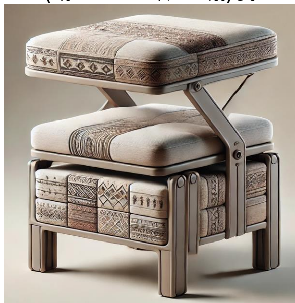
Pic. (21): Multifunctional stool designed with inspiration to symbolic functionality, inspired with Egyptian folk patterns. (designed using AI by the Author)