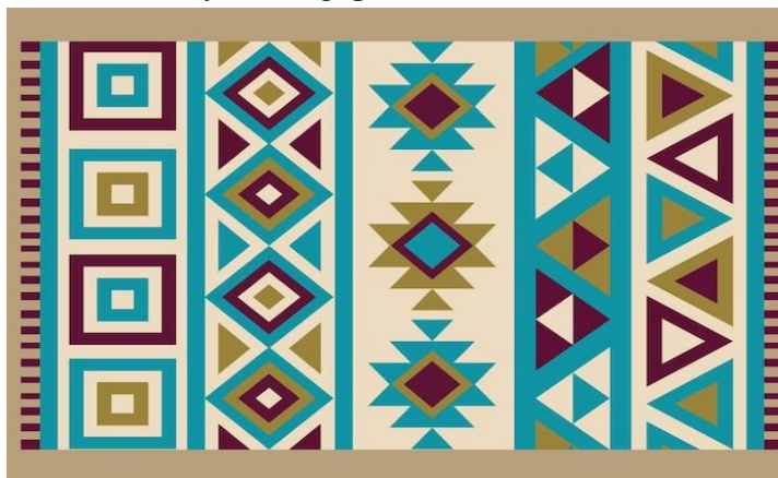
Pic. (14): Traditional Nubian Egyptian rug with the vibrant colors commonly used. https://www.freepik.com/premium-vector/nubian-egyptian-rug-cultural-drawing-art-colors_49632773.htm

4/2 **Color Schemes** : The vibrant colors commonly used in Egyptian folk crafts—such as deep reds, blues, golds, and earthy tones— (example picture 14) can be applied to furniture to create visually striking pieces that evoke a sense of cultural pride.