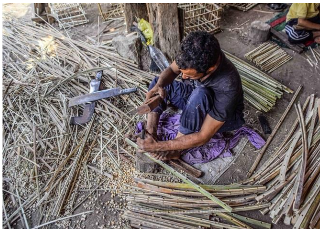
Pic. (19): Traditional method of preparing the palm fronds to create traditional Egyptian boxes.