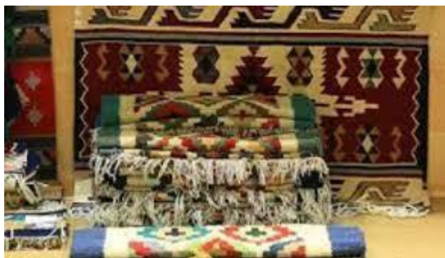
Pic. (17): Handmade carpet inspired with the folk Egyptian art patterns.