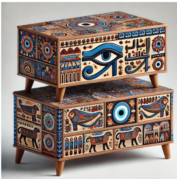
Pic. (20): Multifunctional coffee table designed with inspiration of Egyptian folk cultural stories. (designed using AI by the Author)