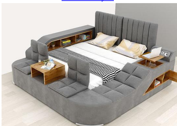
Pic. (7): Bed with Storage sample.

https://www.amazon.co.jp/-/en/Folding-Mounted-Expandable-Multifunctional-Apartment/dp/B0B1W8WG99