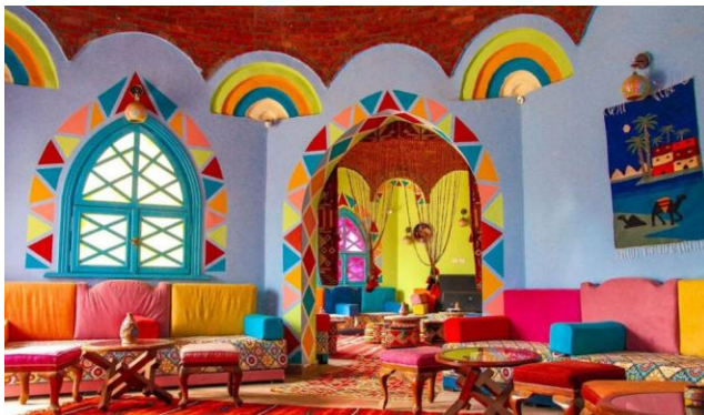
Pic. (9): Living space inside a Nubian house using pointed arch for windows and entrance decorated with geometric patterns.

This design draws inspiration from Nubian folk art , a rich cultural tradition in southern Egypt. Nubian houses are known for their vivid colors , geometric patterns , and natural materials , which are used to create a strong sense of identity (example; pictures 9-12).