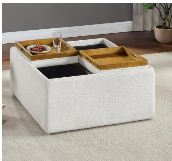
Pic. (2): Storage Ottomans sample.

https://spsfurniture.com/products/2021-new-design-multifunction-sofa-bed-with-folding-armrest-table