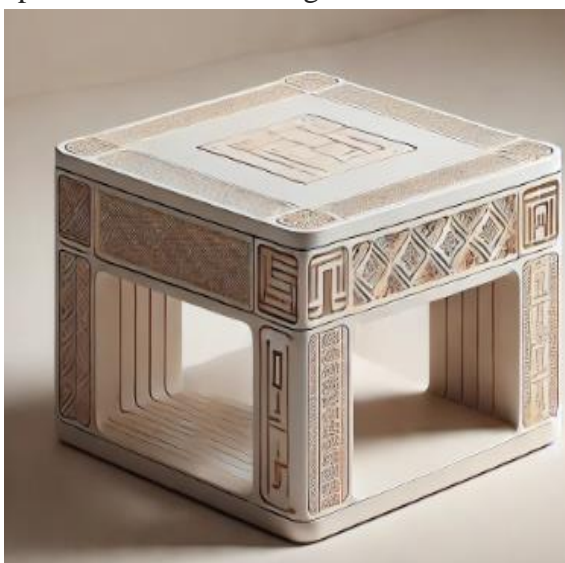
Pic. (22): Minimalistic multi varied tables inspired from Egyptian folk patterns. (designed using AI by the Author)

8/2 **Urban Contexts** : Multifunctional furniture inspired by Egyptian folk identity can be particularly impactful in urban settings, where space is limited but the desire for cultural expression remains strong.