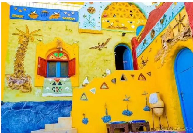
Pic. (11): Wall painting with vibrant colors covering the Nubian house façade.

https://www.egiptoexclusivo.com/en/upper-egypt/nubia/