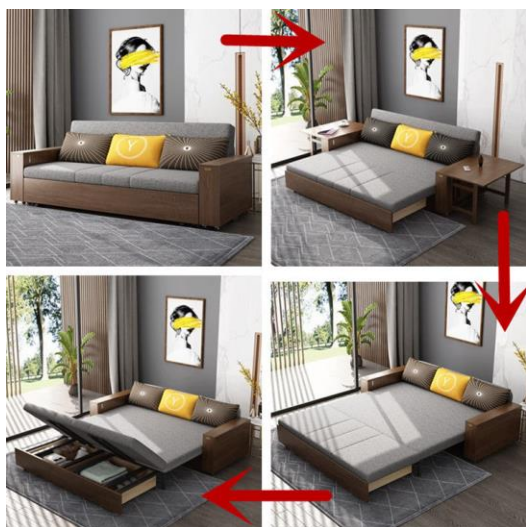
Pic. (1): Multifunctional sofa beds.

1/8 **Convertible Chairs** : Chairs that can be transformed into a bed or chaise lounge (example picture 8).