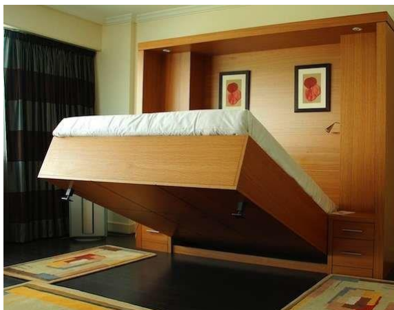
Pic. (3): Murphy Bed sample

https://www.bobvila.com/slideshow/murphy-beds-9-hide-away-sleepers-8431/