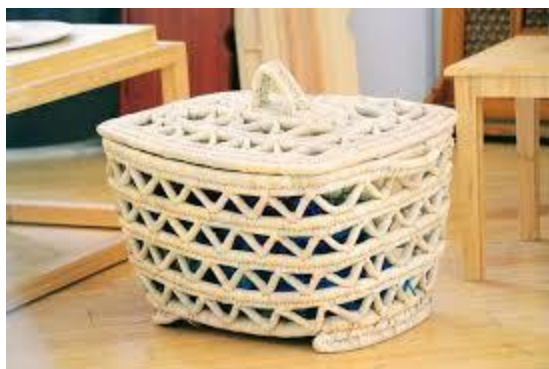
Pic. (16): Handcrafted basket made of palm fronds.

5/2 **Textiles** : Egyptian textiles, such as handwoven rugs or tapestries, can be incorporated into furniture design, providing both aesthetic values and functional uses, like cushions or upholstery (example picture 17).