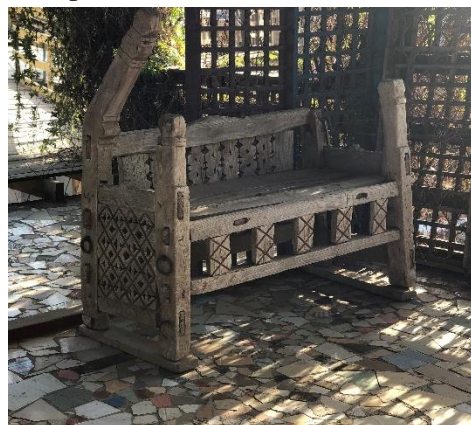
Pic. (15): Traditional Sofa (Nawraj) made from local wood.