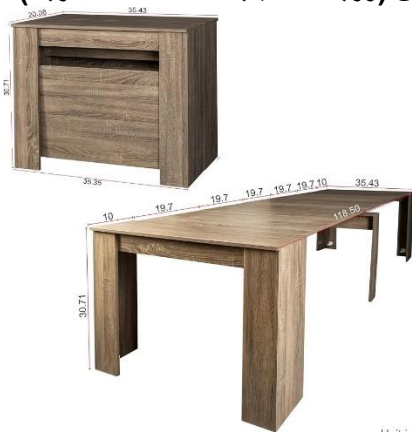
Pic. (4): Extendable Table

https://www.bobvila.com/slideshow/murphy-beds-9-hide-away-sleepers-8431/