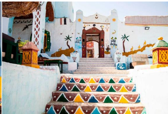
Pic. (10): Façade of a Nubian house.

https://medium.com/@abodoniakar am777/latest-articles-e0bcb2c0d06