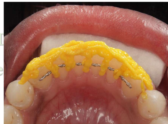
Figure 6: Upper and lower lingual bonded retainers

This technique of bonding the lingual retainer was found to be very convenient and time-efficient for the clinician and comfortable for the patient. An added advantage is that following the use of this jig, PLA being a