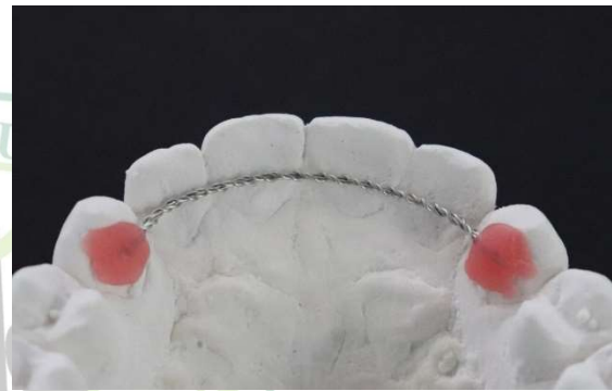
Figure 1: Retainer wire stabilized on models

impressions were taken and dental models were made. The retainer wire was adapted on these models and the ends were stabilized using wax drops (Figure 1). The jig was now fabricated using a 3D printing pen.