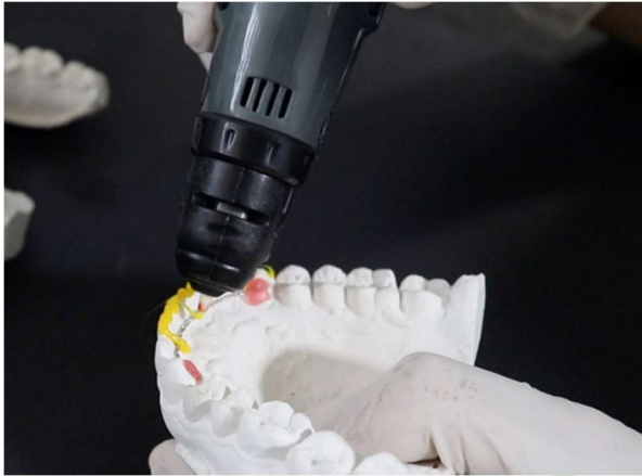
Figure 2: Fabrication of jig using 3D printing pen