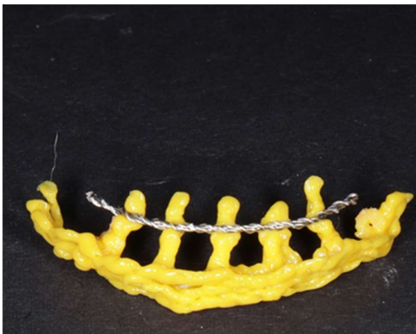
Figure 4: Jig along with retainer wire ready for bonding