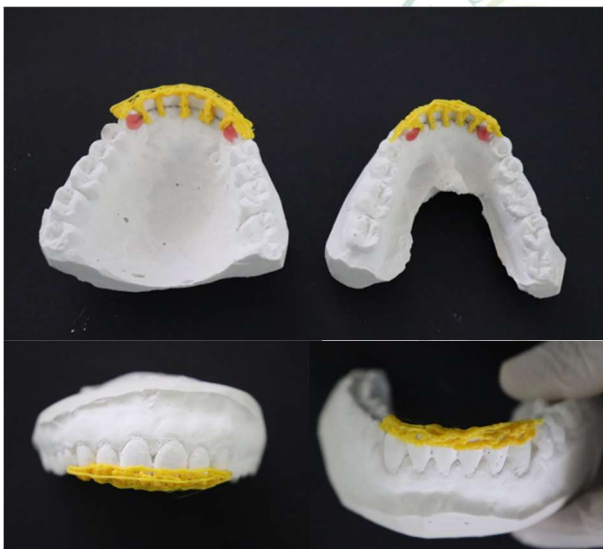
Figure 3: Jigs fabricated using PLA