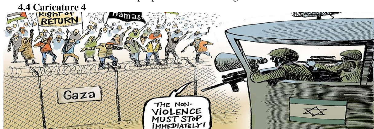
Opinion | On the Gaza Protests - The New York Times (nytimes.com)

The caricature has many elements that help the viewer get the message conveyed. These elements include exaggeration and analogy. Exaggeration is found in the big size of the hand. It indicates the harm that the Palestinians are facing. Moreover, the size of Gaza cannot be seen which shows the amount of destruction and killing that resulted in shrinking the spot. Also, the size of the hand presents the power of Israel over Gaza and which is more powerful than the other. On the other hand, there is symbolism which is represented in the hand as well. Such hand symbolizes the weapons to destroy Gaza and the Palestinians. Furthermore, the caricaturist succeeds in expressing his point of view through logos and pathos. For the logos, he portrays the consequences of the Israeli attacks over Gaza through the crushing and squeezing hand. For the pathos, he includes the direct speeches to force the viewers to imagine the situation in Gaza and how the people there are suffering.