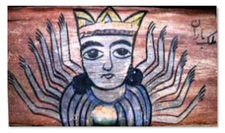
Fig. 14 - The angel of rain (Ramenet saghanefar- - 2009,02, 25)

Sagha-Nefars are structures related to water; many of the images and symbols illustrated in them, directly and indirectly, display water and irrigation. There is an image in Sagha-Nefars called Malek Baran or the angel of rain, a creature with a human head and innumerable hands, which can be considered the symbol of water. (Fig. 14)