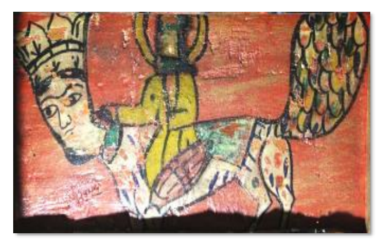
Fig. 11 - Prophet Mohammad atop his horse Boragh (Navaie Sagha-Nefar- 2009,11, 8). Koranic tales such as the ascent of Prophet Mohammad and the court of King Solomon are seen in most Sagha-Nefars.

In the works of Iranian mystic poets, there are tales of the lives of certain celestial figures; naturally, it was very commonplace to have entirely religious figures illustrated in paintings, including Prophet Mohammad himself, as one such selection. The evident and overt case for representing celestial figures would be accentuated when the painter had no option but to resort to illustrating books such as Ghessassolanbia. (Fig. 11)