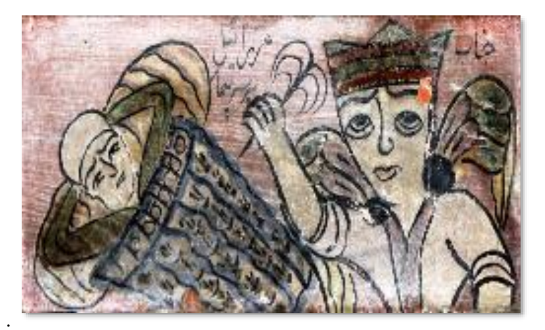
Fig. 13 - the angel Azrael (kebriakola shaghanefar- - 2009,07,15).