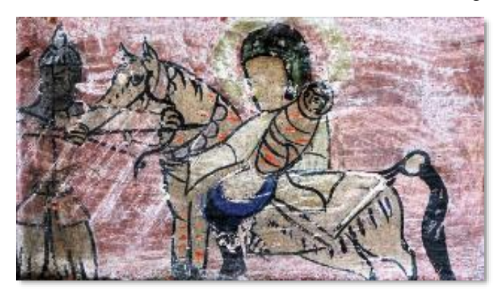
Fig. 2 - Imam Hossein alongside Ali-Asghar (kebriakola shaghanefar<br/>- 2009,\!07,\!15)

Sagha-Nefars are used for mourning the martyrdom of Imam Hossein and his allies. The images in Sagha-Nefars are naturalistic and realistic, such as the image of Imam Hossein with the white halo and his blurred face behind a white mask riding his horse robustly. In Karbala and during Ashoora, Imam Hossein's horse Zoljenah also played a significant role particularly the scene of the horse coming back from Karbala after the Imam's martyrdom which is one of the heartbreaking scenes of the event referred to in the literature and elegies on Imam Hossein.