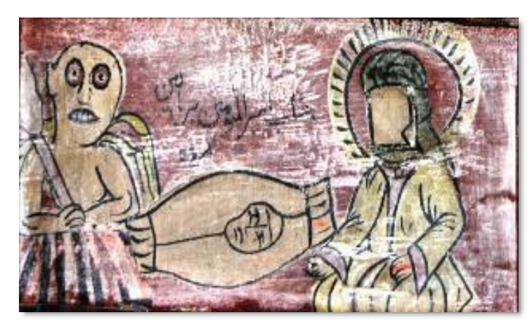
Fig. 12- Imam Ali alongside the dead (kebriakola shaghanefar- 2009,07,15).