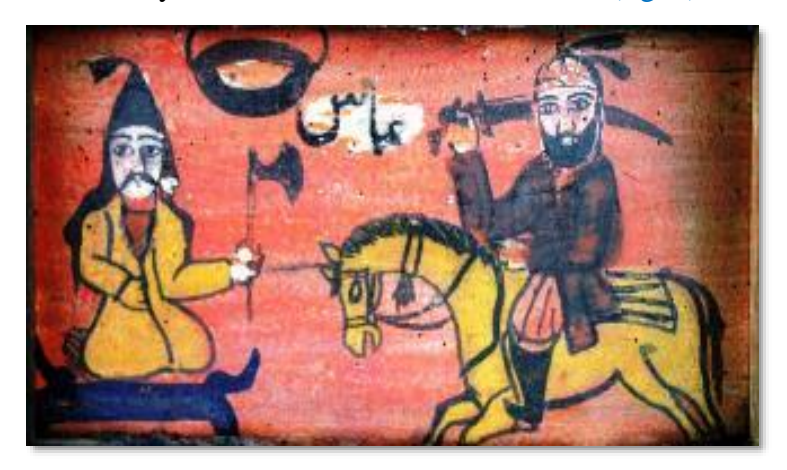
Fig. 9- Abolfazl and the dervish (Navaie saghanefar- 2009,11, 8)

In Sagha-Nefar paintings, the images of the sacred, the infallible, and the clerics bear similarities with Iran's epic and mythical figures; this in its own right is one of the features of folk art. In addition to portraits, Sagha-Nefars are filled with paintings of the true owner of the structures, Abolfazl, and they are even nicknamed as Abolfazli (fig. 9).