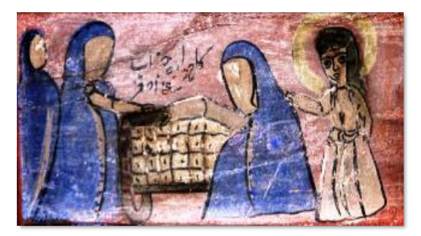
Fig. 6- Ali-Assghar's cradle (kebriakola Shagha-nefar- 2009,07,15)