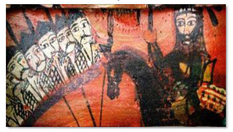
Fig. 8 - Yazid holding the spear with Imam Hossein's head on top of it (Navaie Sagha-Nefar 2009,11, 8)

Since Sagha-Nefars are structures where mourning services are held for Imam Hossein and his martyred allies, the images illustrated there have a function beyond mere decoration and serve a religious purpose.