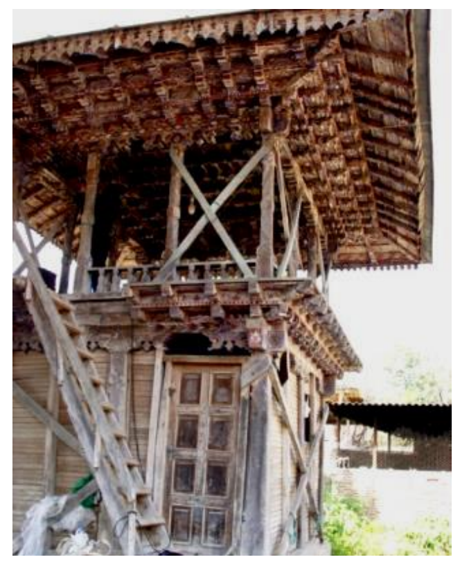
Fig. 1. Shiyadeh Saghanefar (Babol city- 2008,09,25).

The Sagha Nefar is a simple quadrilateral structure influenced by northern Iran's indigenous architecture. Sagha-Nefars are used in the month of Moharam for mourning and commemorating Imam Hossein's cousin Abolfazl