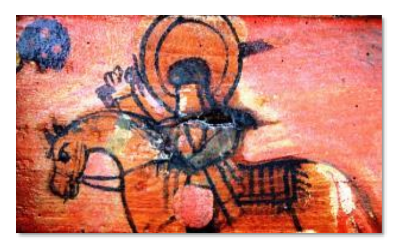
Fig. 4 - Imam Hossein in battle (Navaie saghanefar- 2009,11, 8) The image of Imam Hossein with the white halo and his blurred face behind a white mask riding his horse Zoljanah robustly has been created in an imaginary yet naturalistic and realistic manner.

Another name for Sagha-Nefars is Abolfazli which again demonstrates the emphasis on water as Abolfazl was the one who lost his life trying to bring water for Imam Hossein in Karbala (Fig. 5). Young people also use -Sagha-Nefars in the month of Moharam for mourning and commemorating Imam Hossein's cousin Abolfazl who was brutally slain in Karbala.