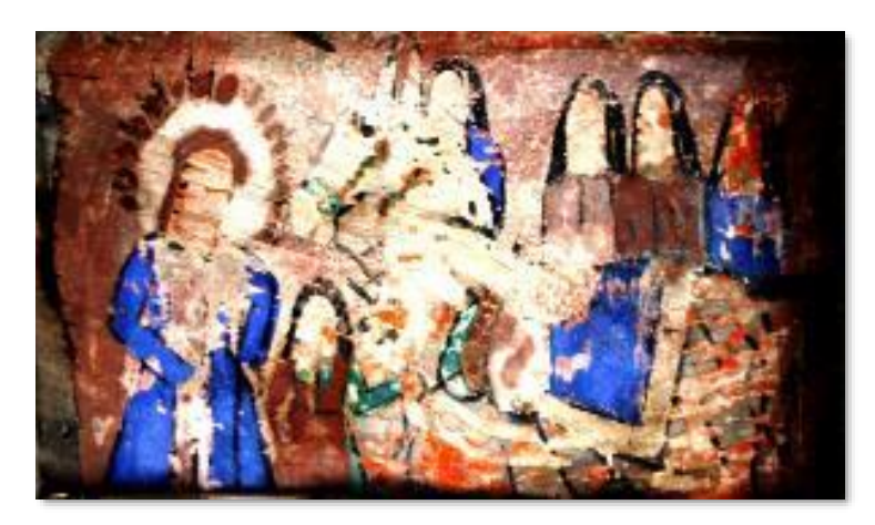
Fig. 7 - Imam Hossein and his allies (Hendo kola Sagha-Nefar- 2009,05, 15).

Since Sagha-Nefars are structures where mourning services are held for Imam Hossein and his martyred allies, the images illustrated there have a function beyond mere decoration and serve a religious purpose.