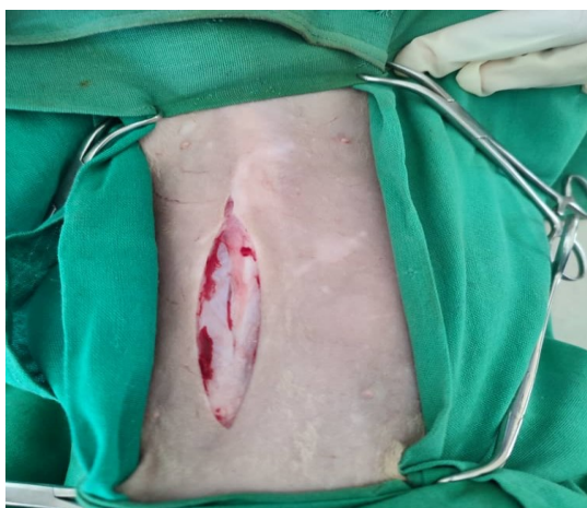
Fig. 1. Ventral midline incision

Keys: a = significantly higher ( p \leq 0.05 ) along the column; b =significantly lower ( p \leq 0.05 ) along the column