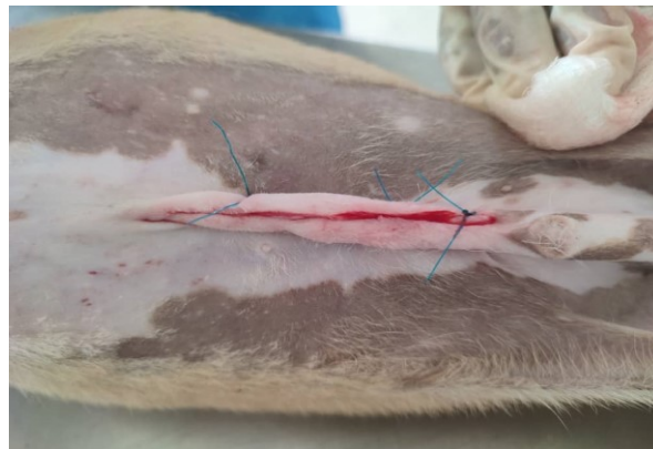
Fig. 5. Suture of the skin using horizontal mattress suture pattern