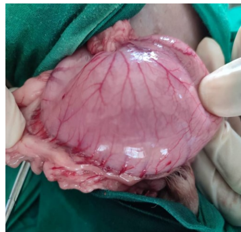
Fig. 2. Exteriorized stomach