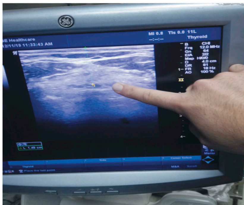
Figure 1. Ultrasound measured distance from skin to epiglottis(US-DSE)at transverse view through thyrohyoid membrane.(Epiglottis is pointed by index finger of the investigator).

Patients were taken to the operating room and were monitored by ASA standard monitors: ECG, NIAB, pulse oximetry, capnography then after preoxygenation with