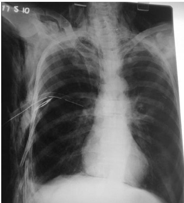
Figure 1 Showing blade along the ICD.

General Physical examination of the patient was remarkable for massive subcutaneous emphysema of face, neck, chest and abdominal wall and respiratory rate of 40 per minute. On arrival in the operating room intravenous line was secured with 16 gauge cannula. All monitoring devices were placed which included continuous electrocardiogram, O 2 saturation of arterial blood and arterial blood pressure. Patient was subjected to general anesthesia and left sided PVC double lumen tube of size 39 French gauge was inserted successfully. Patient was placed in left lateral position and right thoracotomy was commenced. After the thorax was opened right lung was collapsed by clamping the tracheal lumen. As the lung collapsed surgeon was able to locate the surgical blade which was lying in the mediastinum near the superior vena cava (fig. 3). No major injury involving lung, heart and great vessels was found except for mild contusions of right lung. Chest drain was