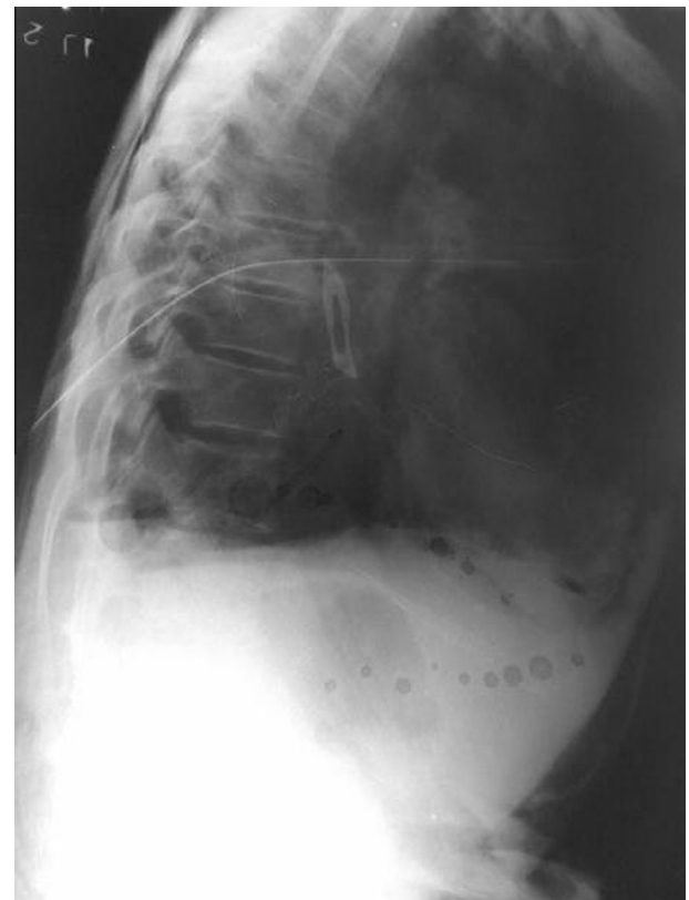
Figure 2 Migration of scalpel blade near the vertebral column.