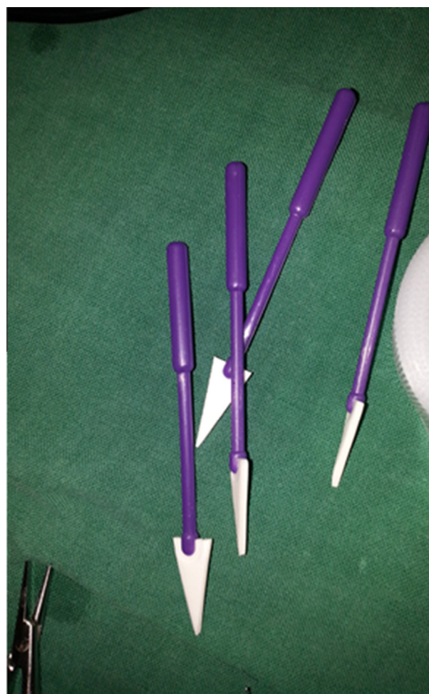
Figure 1 Surgical microsponge before fashioning by scissors to 2 × 3 mm pieces and soaking in bupivacaine (bvi visitec, Dominican Republic).

We performed the pain scoring during every step of surgery: inserting a speculum, tolerance to the microscope light, 3.2 mm temporal incision of the cornea, intraocular Collamer