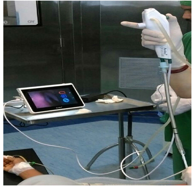
Figure 3. Intubation using Ambu® aScope™ 3.

vocal cords movements became sluggish. At this point ETT was introduced in trachea under vision followed by removal of insertion cord and after cuff inflation ETT was connected to closed circuit. ETT position was confirmed with bilateral chest auscultation and EtCO 2 monitoring. Propofol 80 mg and vecuronium 4 mg iv were given. Oxygen and nitrous oxide were started in 40:60 ratios with isoflurane 1% and patient was made prone taking care of ETT position and adequate abdominal movements assured on controlled ventilation. Adequate padding was given to protect eyes and also on pressure points. Intraoperative period was uneventful. After surgery patient was made supine and upon return of spontaneous efforts patient was extubated after reversing the neuromuscular blockade with intravenous glycopyrrolate 0.4 mg and neostigmine 2 mg.