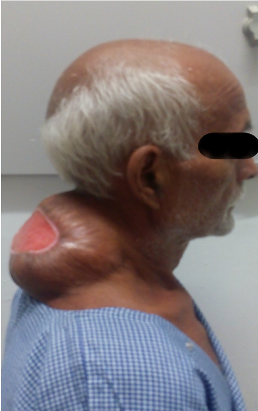
Figure 2. Giant Lipoma at the back of neck.