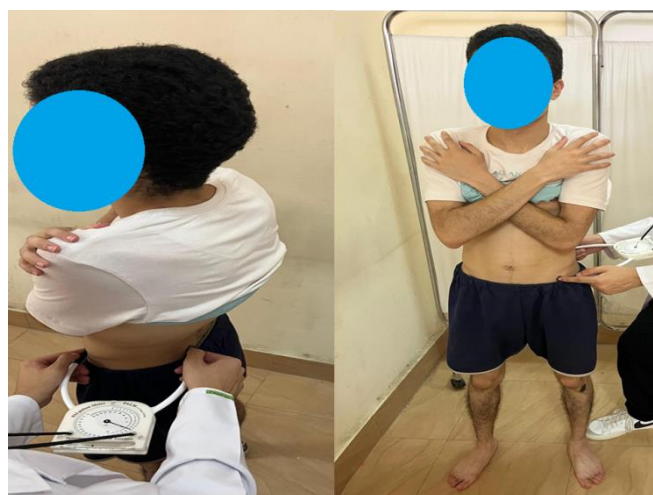
Fig.1: Assessment of pelvic tilt angle from the sagittal plane using PALM.

The interclass correlation coefficient suggests that intra-rater reliability was high for sagittal plane measurements (0.98), on the other hand, the inter-rater reliability was also high for sagittal plane measurements (0.89) [22,23].