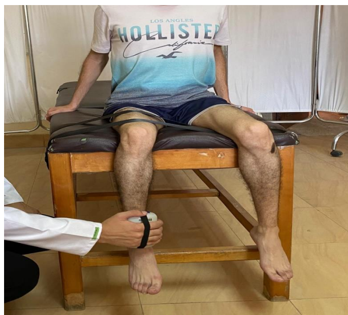
Fig.2: Assessment of knee extensors muscle strength.

The hand-held dynamometer is a dependable and accurate tool used in the evaluation of muscle strength [30]. To measure knee extensor strength, the patient sat with his or her hips and knees flexed to a 90-degree angle and a belt around his or her thigh to fix it. Then, near the ankle joint, on the front of the distal part of the leg, was where the dynamometer was placed. After that, the patient was instructed to contract the knee extensors as much as possible isometrically [30]. Each patient completed two submaximal trials to acquaint themselves with the procedures; following that, they completed three maximum isometric effort trials. 30-second intervals separated the trials after the 5-second contraction [31]. (Fig.2).