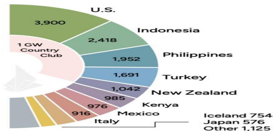
Figure 1. The world 10 top countries utilizes geothermal energy for producing electricity.

The Global energy transformation from fossil fuel technique to geothermal energy technique leads to reduce carbon dioxide emissions and prevent greenhouse gases. Ice Land is the best example, where it exploits its geothermal energy resources for producing 35% of electricity generated in Ice Land [2]. Italy is a member of the great industrial countries and the first country in the World utilizes geothermal energy resources for producing electricity in 1904. Methane is the major of greenhouse emissions due to coal-fired power generation plants. But transformation to gas-fired power generation plant is not optimum solution for reducing the rate of greenhouse emissions into the atmosphere [3]. So, renewable energy is the optimum solution for elimination of greenhouse emissions as well as it is consider economic power generation type and satisfies the sustainable development in the World. Geothermal energy is the best type of renewable energy for producing reliable power because it doesn't depend directly on the environmental circumstances like photovoltaic or wind power generation plants. Figure (1) shows the 10 top countries of the world which utilizes geothermal energy resources for producing electricity [2 and 3].