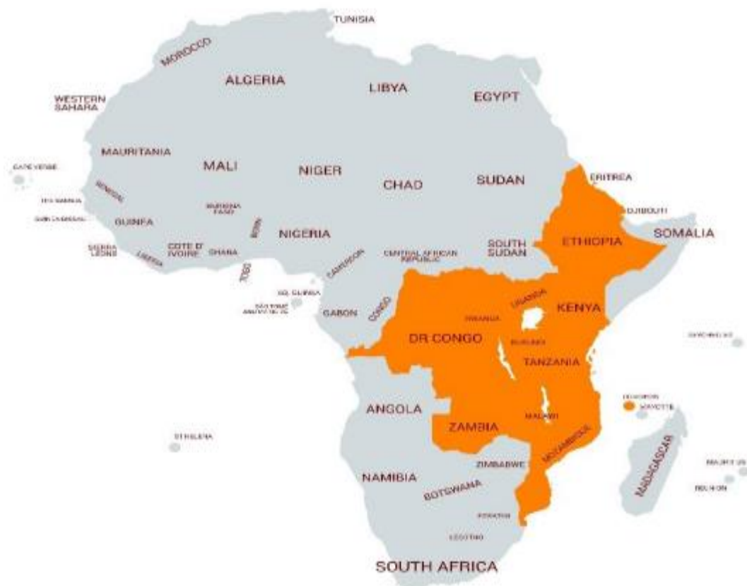
Figure 2. The map of geothermal energy resources in Eastern African Region.

Geothermal energy researchers have been supported by specialist companies and governmental institutions to obtain the optimum results of geothermal energy projects in East African countries like Kenya, Ethiopia and Djibouti. So, the first exploratory wells were drilled in Olkaria (Kenya), Tendaho and Aluto (Ethiopia) and Asal (Djibouti). Most of geothermal energy projects in Kenya, Ethiopia and Djibouti are discontinuous because of aid loss by governments and loss of geothermal energy professional researches. Faculty of African Postgraduate Studies, Cairo University, Giza, Egypt qualifies more geothermal energy researchers with cooperation of Faculty of Engineering, Cairo University, Giza, Egypt. Also, New and Renewable Energy Authority NREA, Cairo, Egypt provides technical and financial aids to geothermal energy researchers for satisfying the sustainable development in Egypt and African countries. Figure (2) shows the map of geothermal energy resources in Eastern African Region [6].