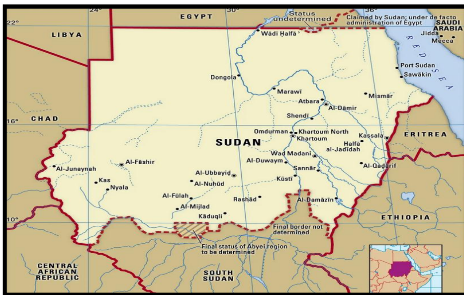
Figure 2. Port Sudan location. Reference: google, 2024.

Port Sudan, particularly the South Port Container Terminal, plays a vital role in Sudan's maritime trade. The port serves as a gateway for international trade and is strategically important for neighboring landlocked countries such as Chad, Central African Republic, Ethiopia, and South Sudan. These countries rely on Port Sudan for the import and export of goods, making it a critical hub for transit trade in the region.