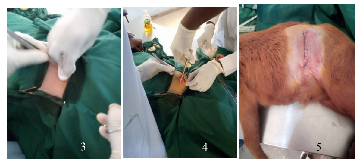
Plates 3, 4 and 5: Final scrubbing, skin incision and skin closure with Ford interlocking suture pattern respectively.

Plates 1 and 2: Advancing a hypodermic needle and injecting the agent into the epidural space