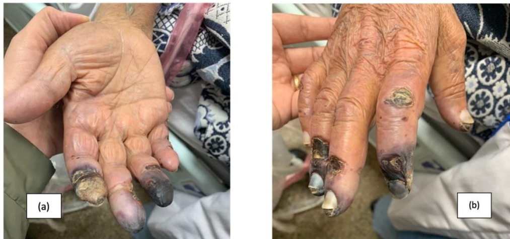
Figure (4): A 67-year-old female patient was admitted to the Critical Care Unit. The patient started to develop gangrenous fingertips of the right hand, which is known as ESRD on RD through right BC AVF; she was diagnosed with a "steal phenomenon" with very low radial and ulnar arteries PSVs on DUS; 17 and 12 cm/s, respectively. Tracing the AVF, we found a distal stenotic segment to the fistula at the outflow vein (cephalic vein).