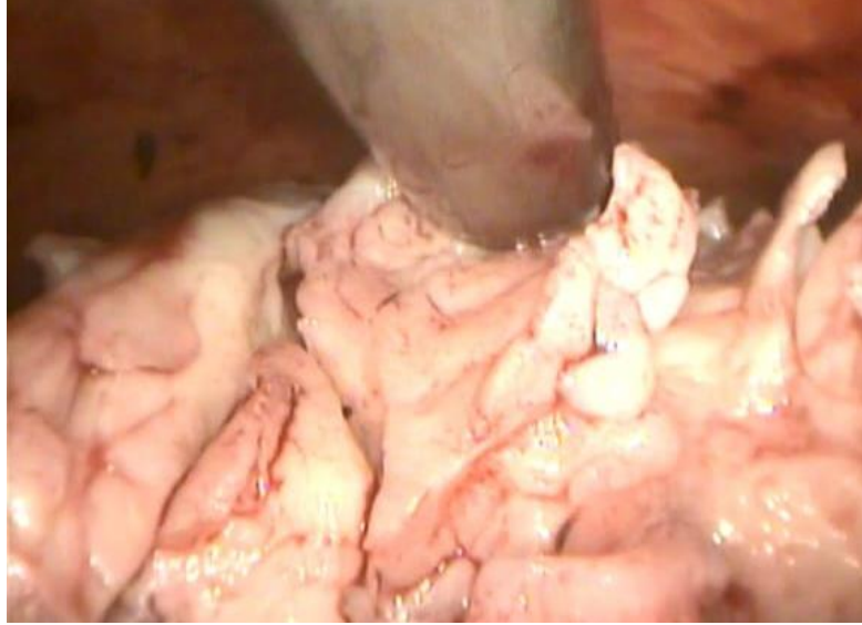
Figure (3S): Morcellation of myoma.