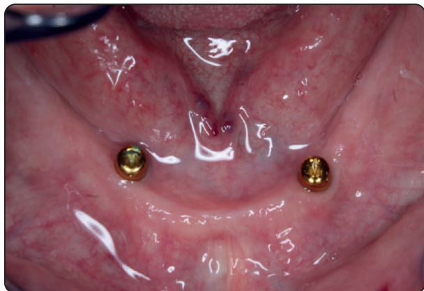
Fig. (1) Two implants with Locator abutments

was removed from pre-prepared lingual vents (Fig 2a). Each right-side metal cap was expunged from the nylon insert (Fig 2b). RS600 (R.S, Bredent Medical, Germany) base and catalyst was mixed automatically by attached mixing tip. (Fig 2c). The empty metal cap was filled with RS600 and was set under the maximum intercuspation of the patient. After setting, the excess was trimmed with sharp scalpel (Fig 2d).