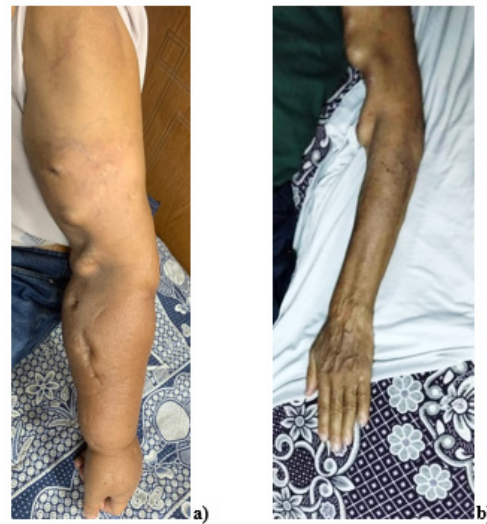
Fig. 3: Preoperative images show significant arm and forearm edema (a). 6 months post- Percutaneous transluminal angioplasty, the edema resolved substantially, improving limb function and quality of life (b).