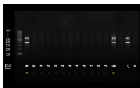
Fig. 2. Agarose gel electrophoresis showing PCR products of D. fragilis 18s rRNA gene (403 bp); Pc: Positive control; W: Negative control. Samples 73, 76, 88, and 100 are positive.