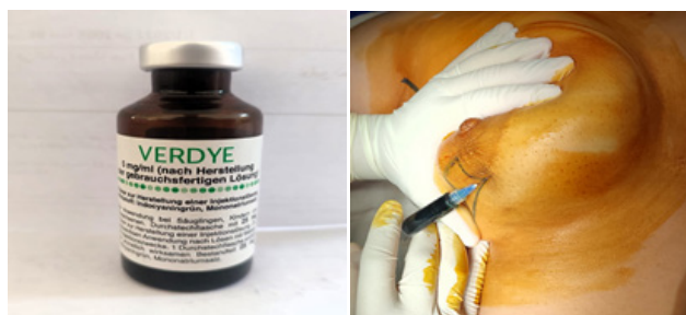
Fig. 1: Injection of indocyanine green into retro-areolar area.

The resected lymph nodes were examined with an IMAGE 1 S camera system and were classified as SLNs or para-SLNs according to ICG fluorescence (Fig. 3).