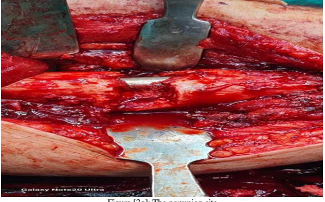
Figure [3g]: The nonunion site