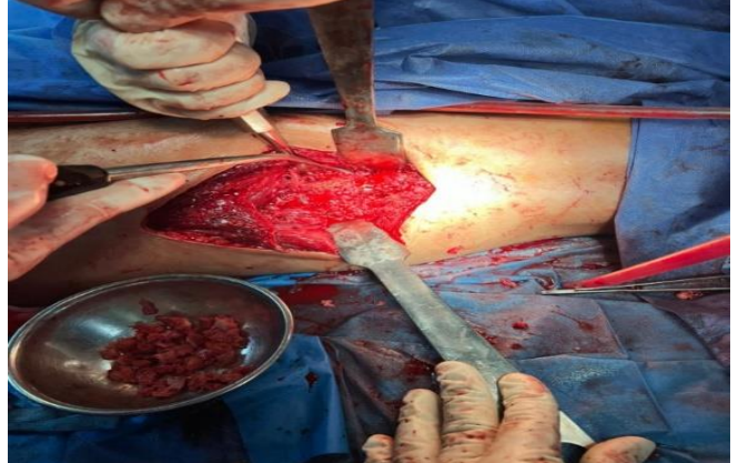
Figure [3h]: Putting graft pieces in non-united fracture site