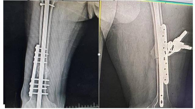
Figure [4d]: Postoperative follow up X-ray of case 1 after 6 months