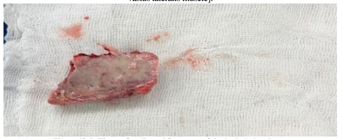
Figure [3e]: The graft collected from one of the included patients.