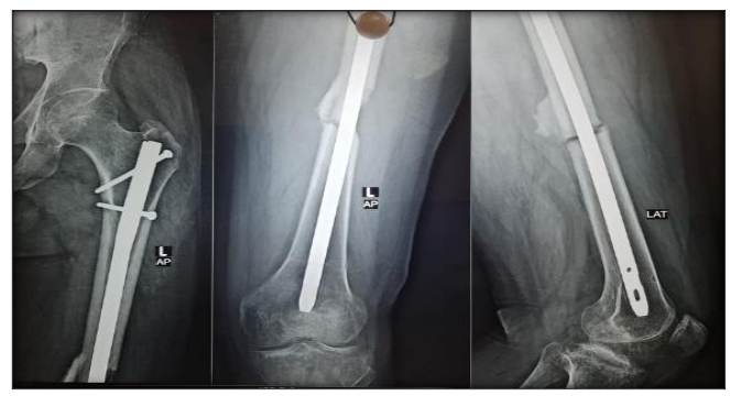
Figure [4a]: Figure [4a]: Preoperative x-ray of case 1.