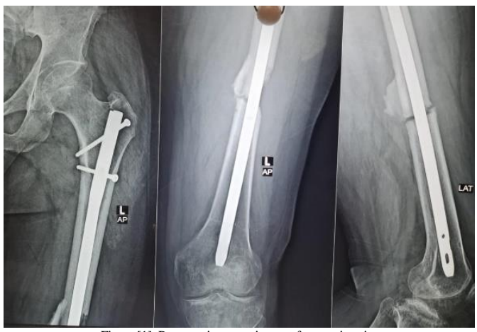
Figure [1]: Preoperative x-ray image of non-union site

Preoperatively, and at admission, all patients were thoroughly assessed by history taking, clinical examination [to assess mobility at fracture site, the skin around the fracture, presence of any leg length discrepancy and to check the presence of any infection]. In addition, routine laboratory workup was performed [included CBC, ESR, CRP, PT, PTT, INR, AST, ALT, RBS and Creatinine, and in some cases HBA1c, s. albumin and creatinine clearance was performed]. Finally, radiological examination in the form of two views [anteroposterior and lateral views] of plain radiography was performed for each affected femur. In addition, the ipsilateral knee and hip were imaged for comparison [Figure 1]. Preoperative computed tomography [CT] examination was performed to assess the union site, and intraoperative C-arm was used to confirm non-union [Figure 2].