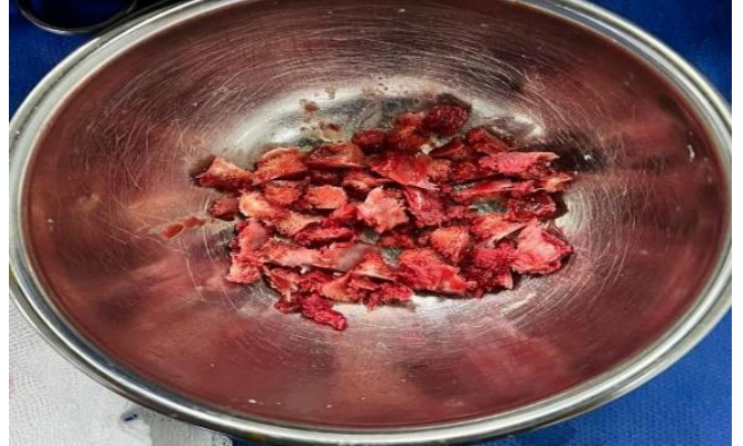
Figure [3f]: Graft in pieces