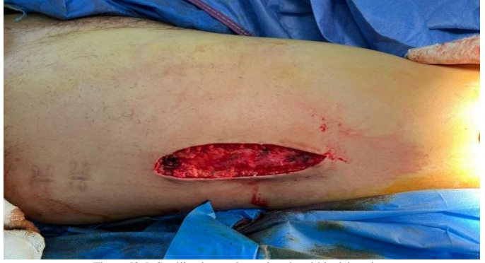
Figure [3c]: Sterilization and opening the old incision site.