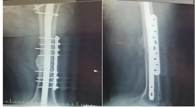
Figure [4c]: Postoperative follow up X-ray of case 1 after 3 months.