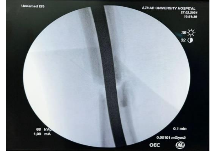
Figure [2]: Intraoperative c-arm image of non-union site.

We used several criteria for non-union to standardize the data collection. These criteria included nonunion associated with sepsis or no [septic or aseptic], the type of nonunion and its anatomical site. First, nonunion was defined as [1] persistent pain at the site of the fracture for at least 6 months after the primary treatment surgery; [2] absent bridging callus at the end of the sixth month, provided that, it affects three out of 4 cortices, or [3] absent radiographic signs of progressive healing in a row, for at least three months.