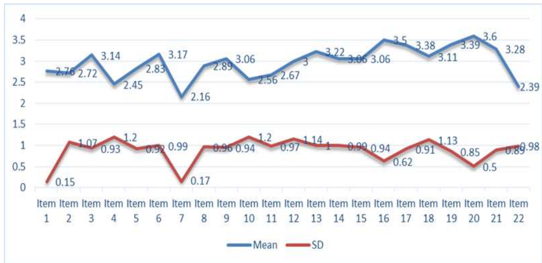
Figure 2: Mean cluster line chart of youth and adult on the VTE skill needs for the youth unemployment in North Central, Nigeria

Figure 2 shows the mean comparison of response of youth and adult. The line chart rating indicates that both respondent have similar opinion as the ratings are so clustered. The figure revealed that average mean of 2.56 to 3.39 which are greater than the criterion mean level of 2.5 of agreement in items 1-21 says that all respondents agreed with those item as necessary skills youth can learn to become a self-reliant citizens and that can make them to be a job creator rather than a job seeker.