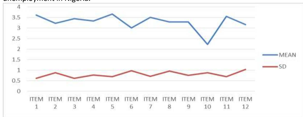
Figure 1: Mean response of Adult and Youth on the contribution factors to the youth unemployment in Nigeria.

The data presented in table 1 on factors that affect youths unemployment in Nigeria, revealed that the respondent agreed with all the items with mean score ranging from 3.17 - 3.67 except item 10 which has mean score of 2.22. This signifies that most of the respondents agreed that all the factors are responsible for youth unemployment in Nigeria.