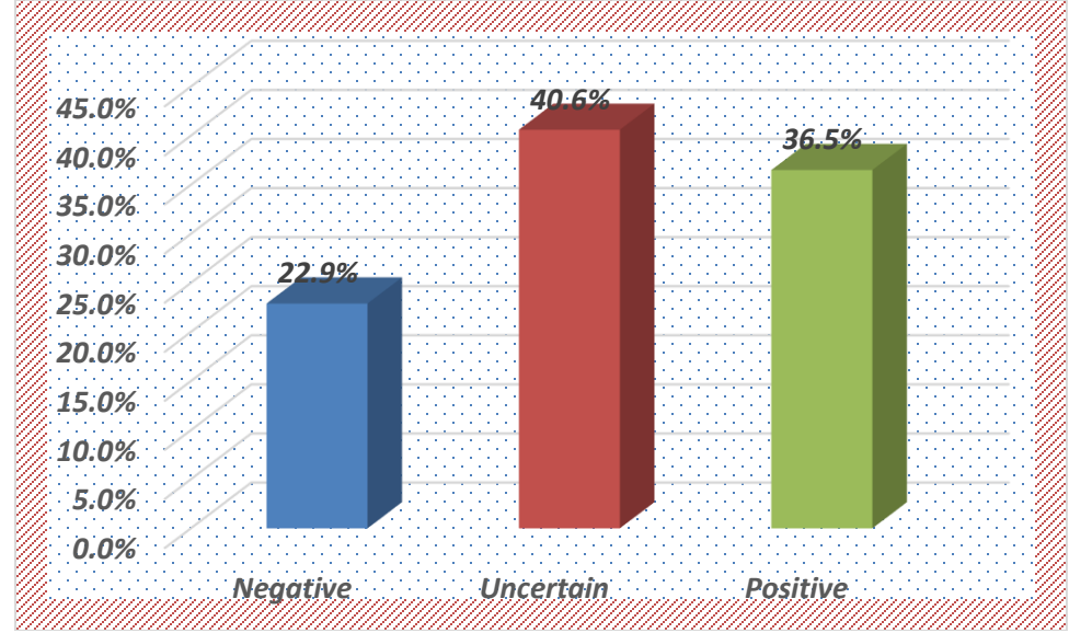
Figure (3): Percentage distribution of total attitude score of the student participants (n=192).

Table 4: correlation between the studied nursing students' total knowledge score and total attitude score (n=192).