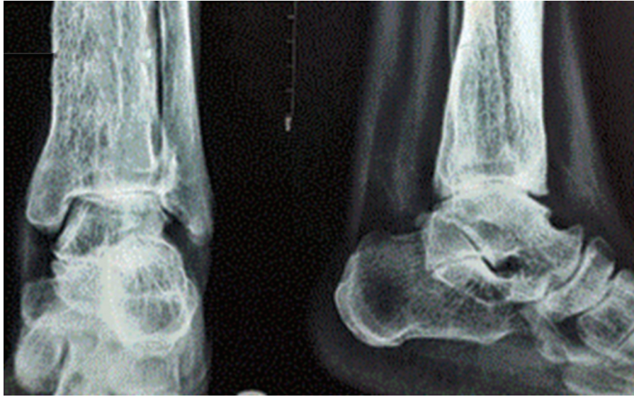
Standing anteroposterior and lateral ankle radiographs showing narrowing of the ankle joint space and osteophyte formation.