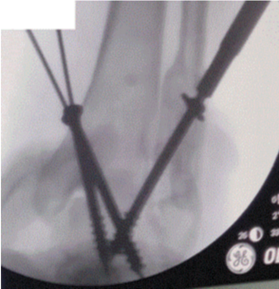
Intraoperative fluoroscopic image showing the cannulated screws insertional configuration over guide wires for ankle joint fixation.