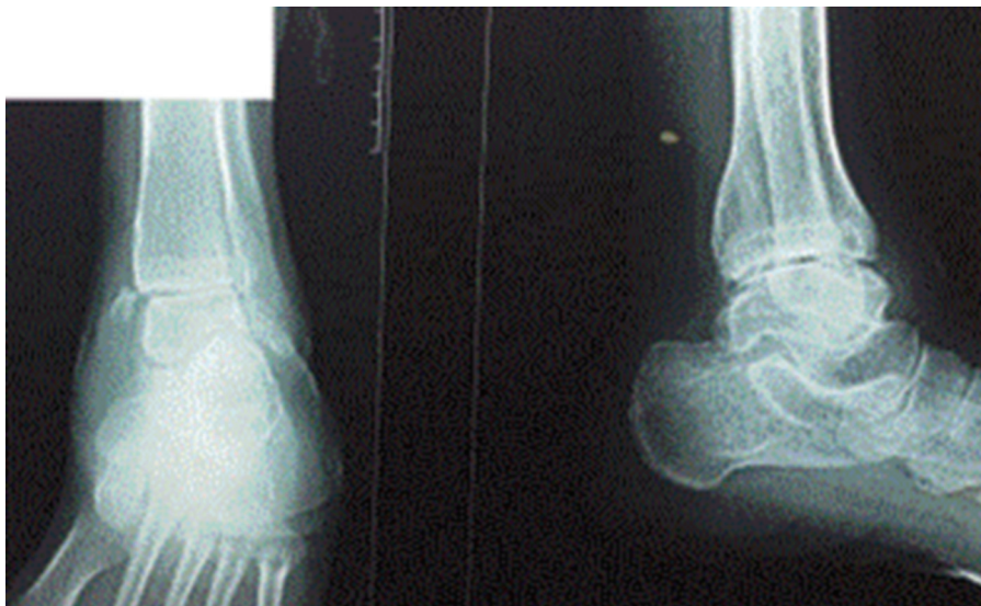
Standing anteroposterior and lateral ankle radiographs showing complete erosion of the medial malleolus of the ankle joint.