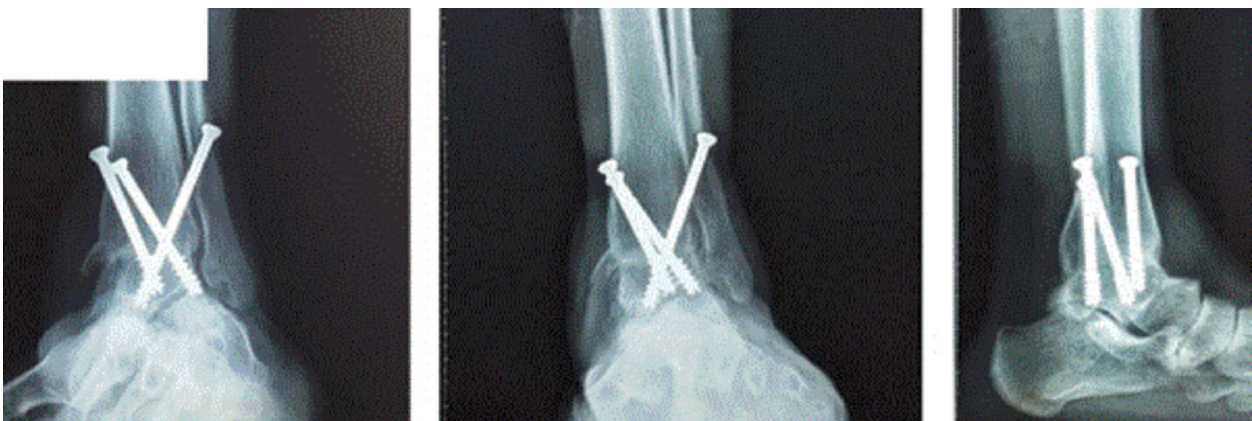
Standing anteroposterior, mortise, and lateral ankle radiographs showing joint fusion 3 months postoperatively.