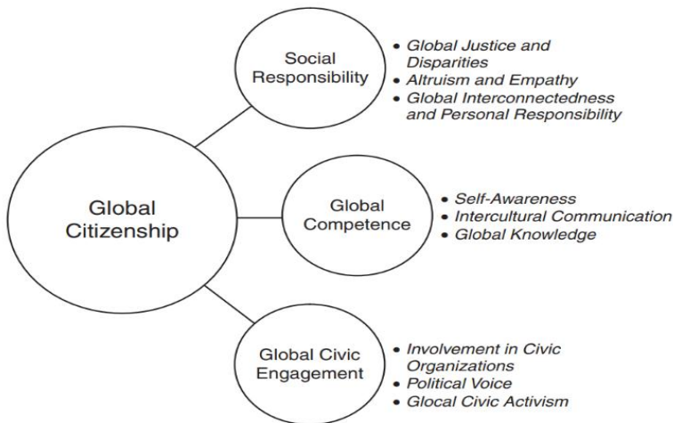
Figure 2. Global citizenship conceptual model, Morais & Ogden, (2010)

Global Civic Engagement: The recognition and action on societal issues.