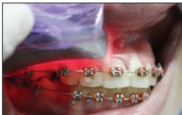
Figure (1) Buccal application of laser at the middle third of canine

Precautions were taken before LLL application procedure where both the patient and the operator used appropriate protective glasses specific for the wavelength used according to the safety rules. The patient wore a self-retaining retractor and the surface exposed to the low level laser was air dried.