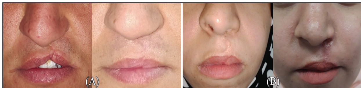
Figure (1) Pre and six months postoperative healing in (A) group I and (B) group II